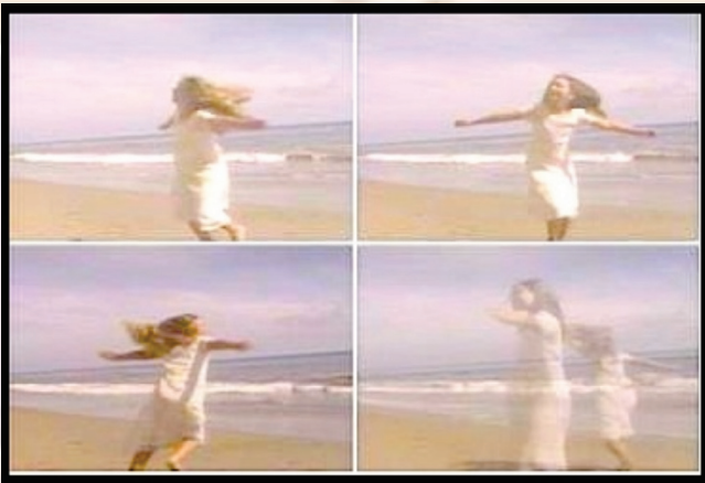
Young Girl Spinning

Video stills from Spinning On Uncertain Ground