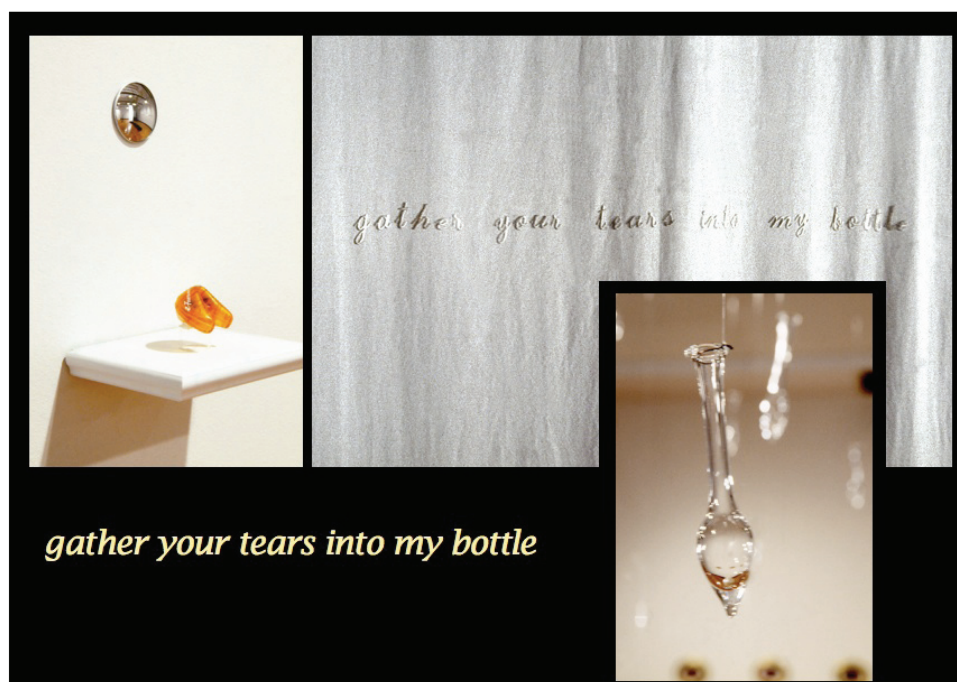
Spinning On Uncertain Ground, site-specific, multimedia installation Installation details: electronic fortune cookie, lachrymatories with pearls, cloth panel embroidered with text: gather your tears into my bottle. Our invisible longings and desires exist inside the visible...

A secret turning in us makes the universe turn. Head unaware of feet, and feet head. Neither cares. They keep turning. ~ Rumi