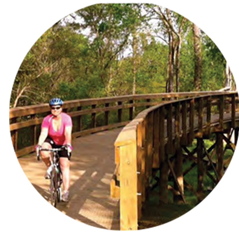
BRIDGE OVER STREAM