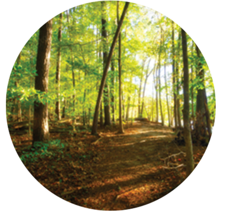
NATURAL SURFACE TRAILS