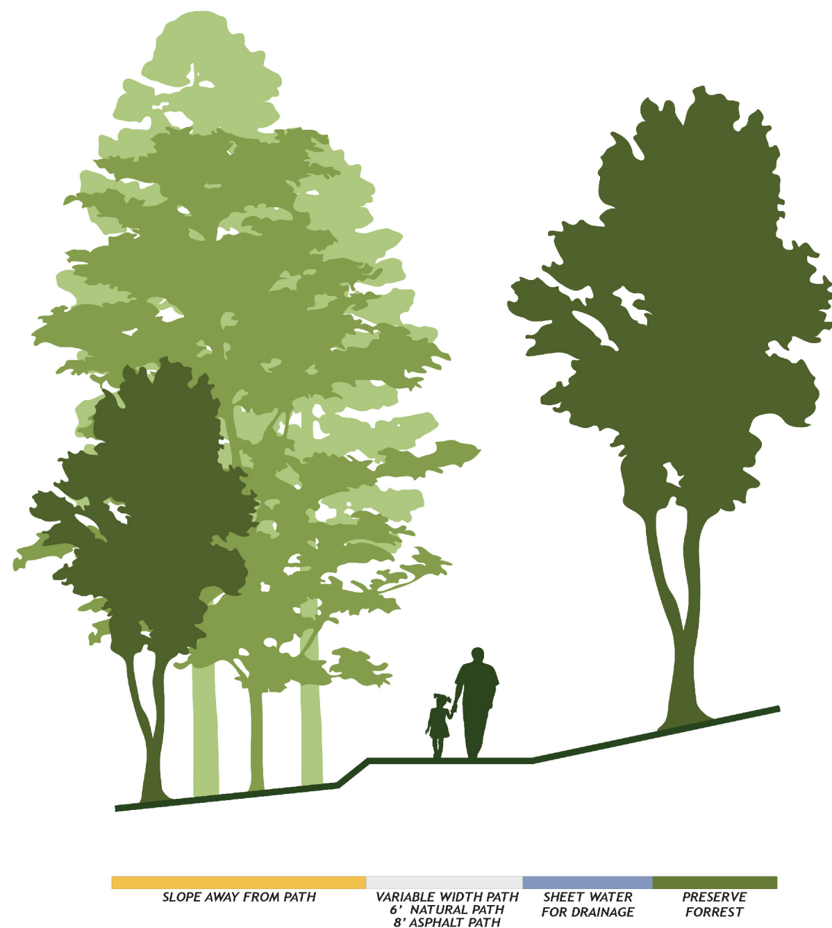
SLOPED TRAIL SECTION EXAMPLE