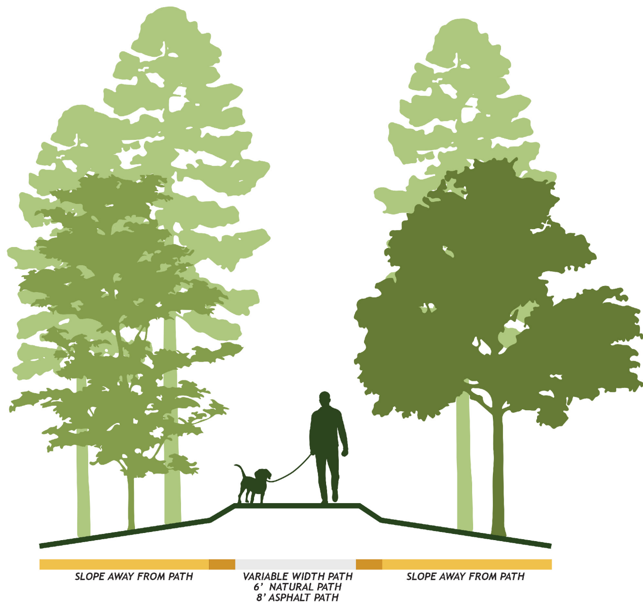
FLAT TRAIL SECTION EXAMPLE