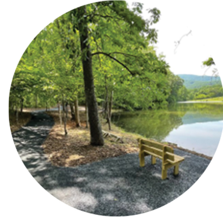
POND LOOP TRAIL