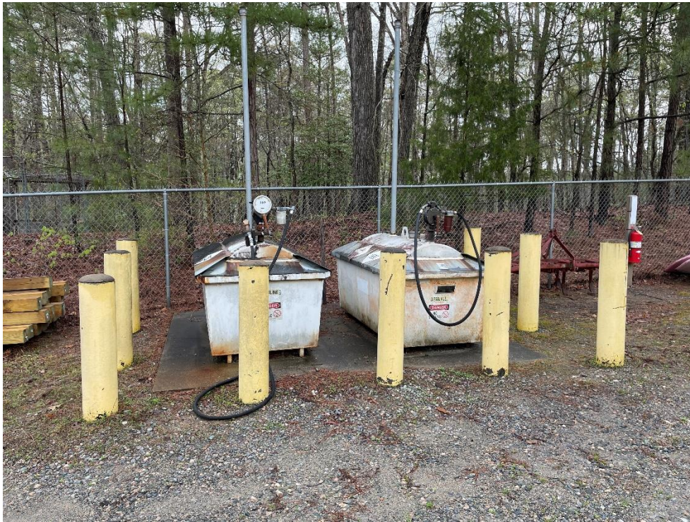
HARRIS LAKE COUNTY PARK – EXISTING FUEL TANKS