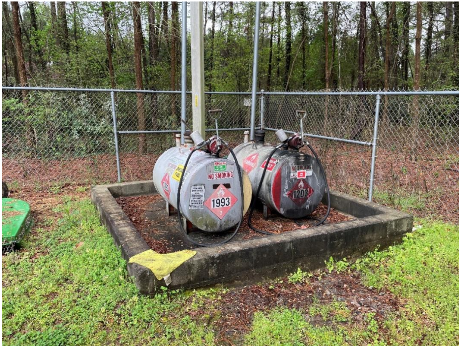
CROWDER COUNTY PARK – EXISTING FUEL TANKS