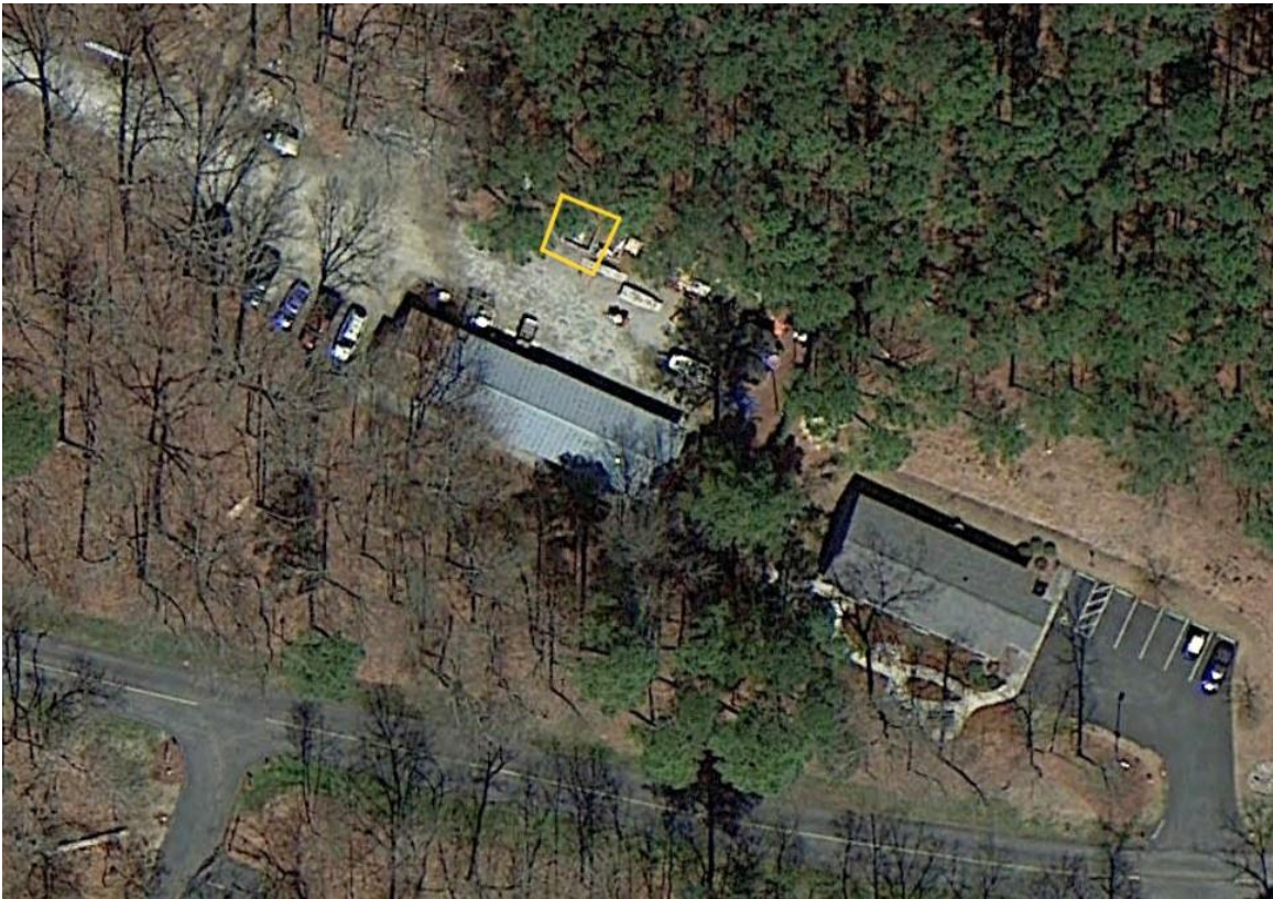
LAKE CRABTREE COUNTY PARK – MAINTENANCE AREA