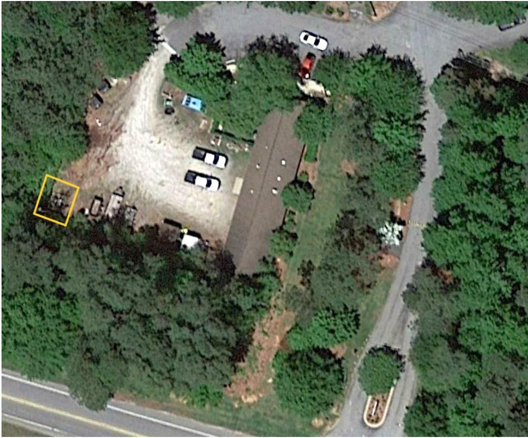
CROWDER COUNTY PARK – MAINTENANCE AREA