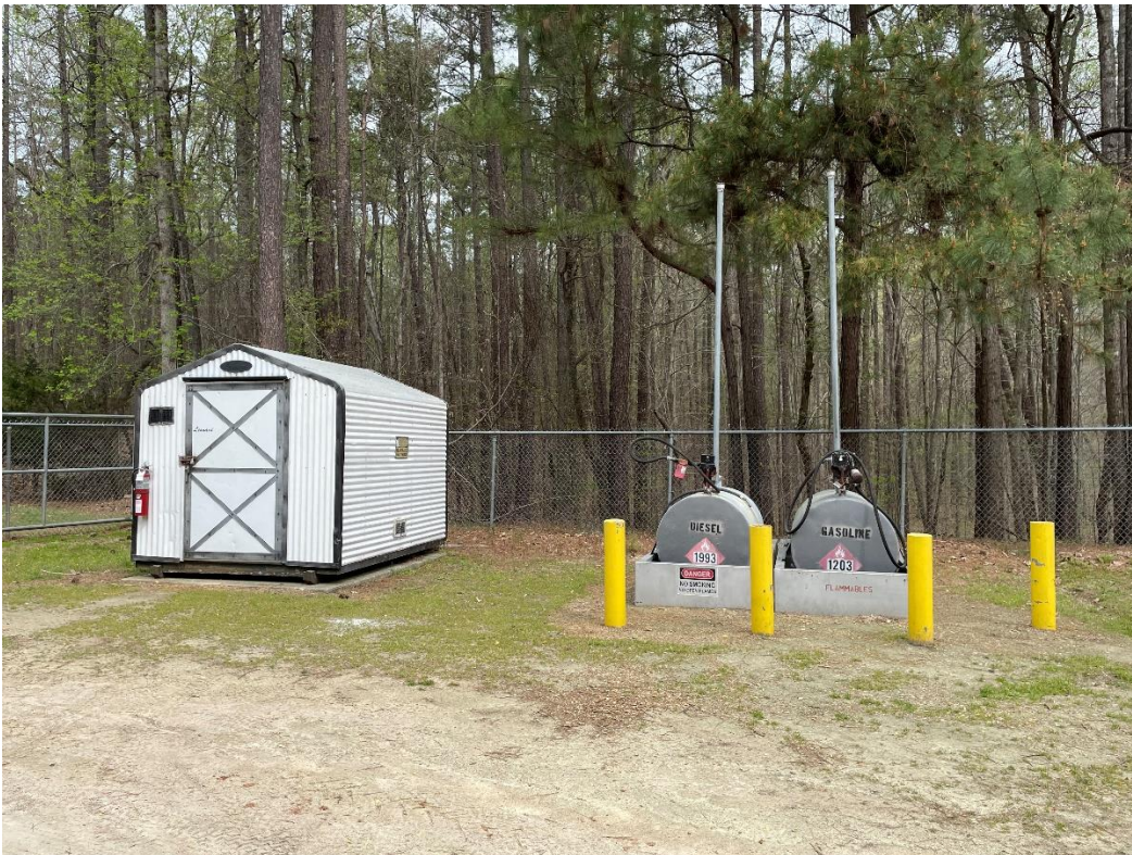
BLUE JAY POINT COUNTY PARK – EXISTING FUEL TANKS