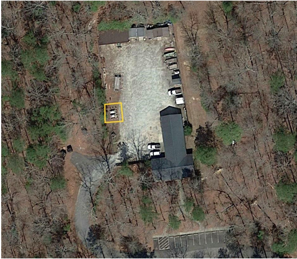
HARRIS LAKE COUNTY PARK – MAINTENANCE AREA