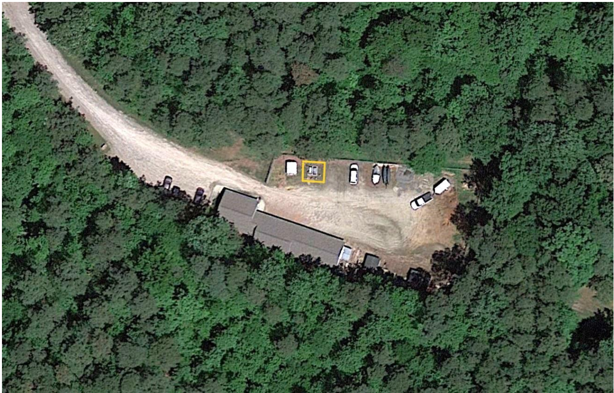
BLUE JAY POINT COUNTY PARK – MAINTENANCE AREA