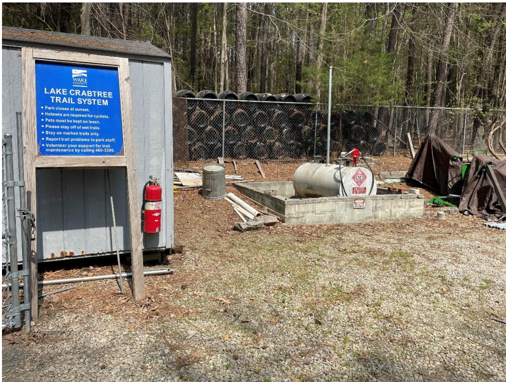
LAKE CRABTREE COUNTY PARK – EXISTING FUEL TANK