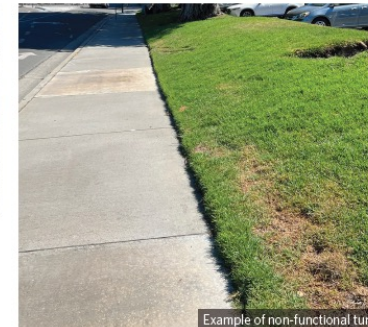
Example of non-functional turf.

Non-functional turf is irrigated lawn grass area not meeting the definition of functional turf.