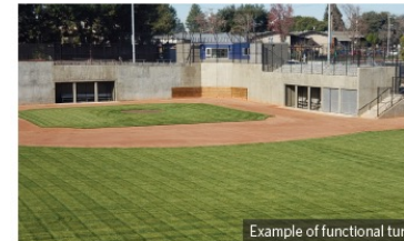
Example of functional turf.

Under the Executive Order N-7-22, to prevent the unreasonable use of water and to promote water conservation, the use of potable water is prohibited for the irrigation of non-functional turf at commercial, industrial, and institutional sites (CII). Non-functional turf cannot be watered with potable water unless watering occurs directly under the canopy of a tree or shrub.