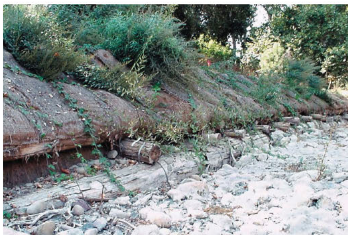
Site of completed erosion repair.