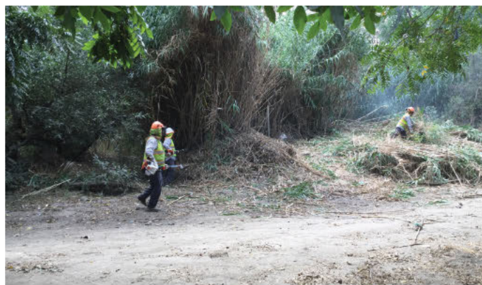
Crews removing giant reed ( arundo donax ), an invasive plant, from creek.

Stream stewardship activities that remove invasive plants along streams are conducted by Valley Water staff. This work may occur on Valley Water property and easements with permission from the property owner. Because it is important to eradicate invasive plants along a creek on a watershed and watershed wide basis and the Safe Clean Water Program provides funding for this activity, staff may also seek permission to perform this work on private property.