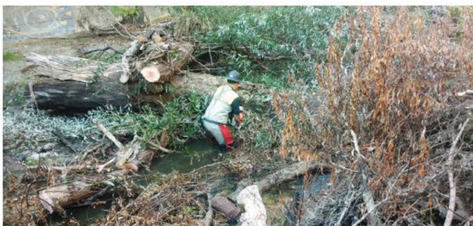
Staff removing fallen trees blocking creek flow.

Maintenance work is prioritized based on several considerations, including available resources. Higher priority is given to capital projects completed with federal partners, levee maintenance, and work to preserve channel capacity.