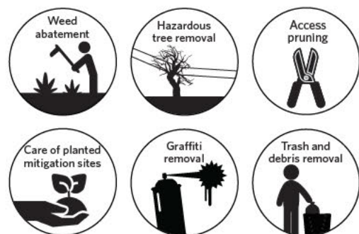
Maintenance activities as a landowner

Valley Water performs work on properties owned in fee title or where otherwise obligated by permit or agreement. These activities include weed abatement, hazardous tree removal, pruning for access, care of planted mitigation sites, fence and erosion repair, and graffiti, trash, and debris removal.