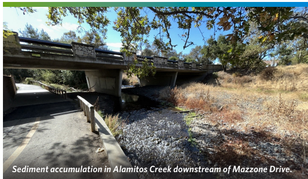
Sediment accumulation in Alamitos Creek downstream of Mazzone Drive.