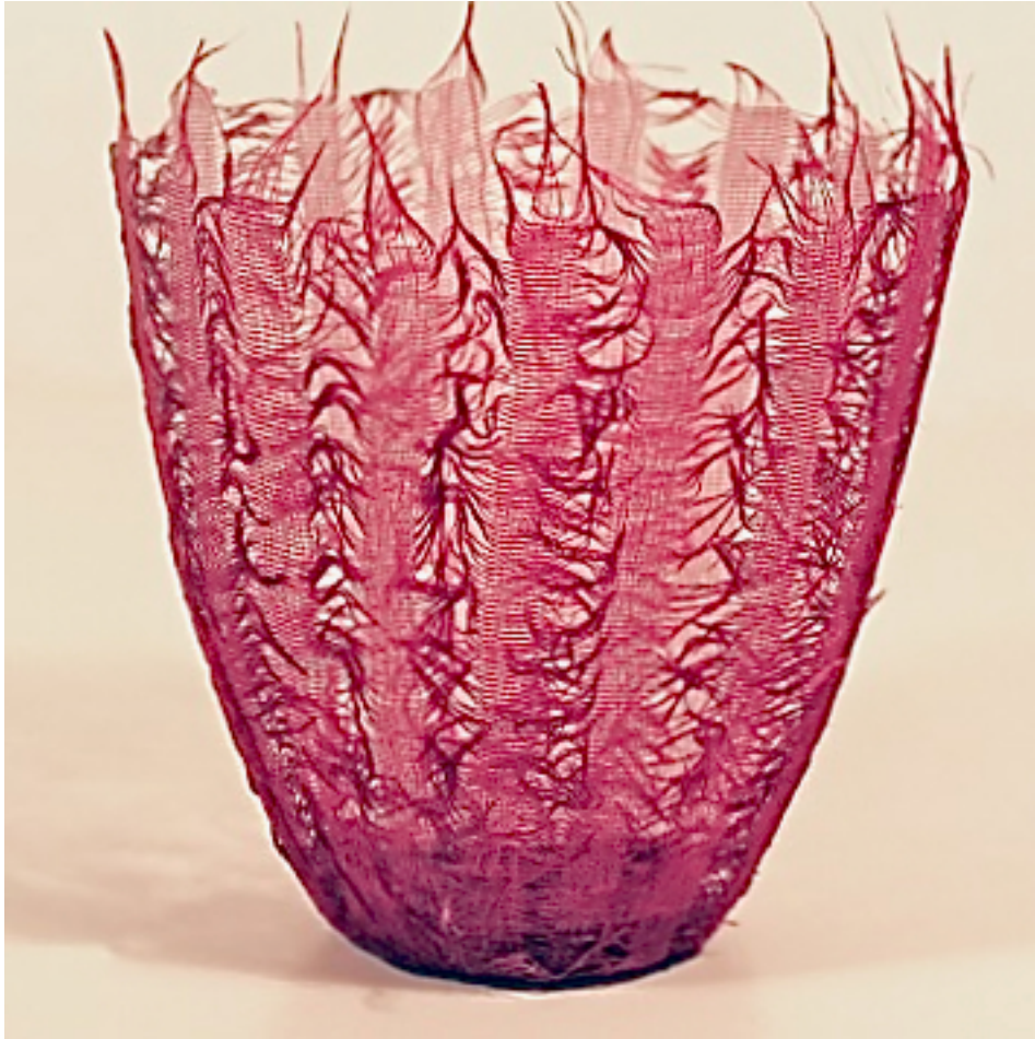
Silk Basket by Beryl Reichenberg, 5 x 5"

My children's books can be seen at www.berylreichenberg.com