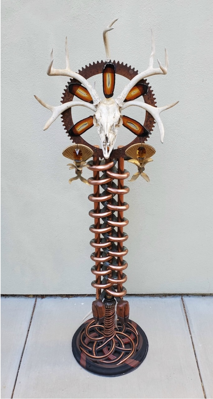
Supernumerary (Deer Totem) by Robert Schuerman, copper boiler coils, deer parts, agate, 66" T x 20" x 20"