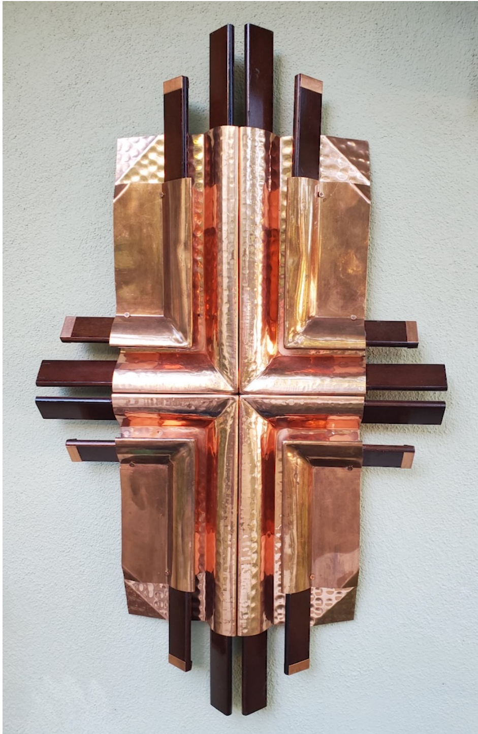
Intersection, two copper trays cut into quadrants, wooden slats. 38" t. x 23" w.