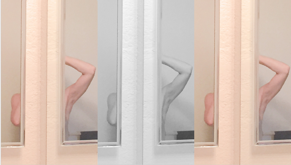
Wall of Silence