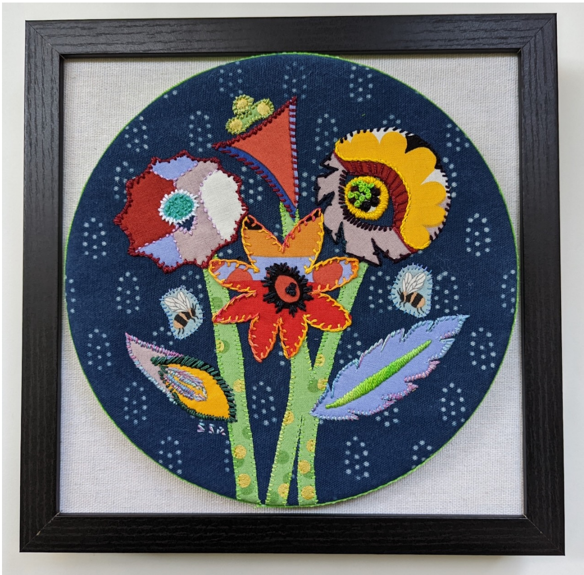
Bold Flowers by Sharon Rossi. Cotton fabric, fusible webbing applique, hand-dyed embroidery thread. Embroidery on wood hoop. Displayed in a 10" square frame.