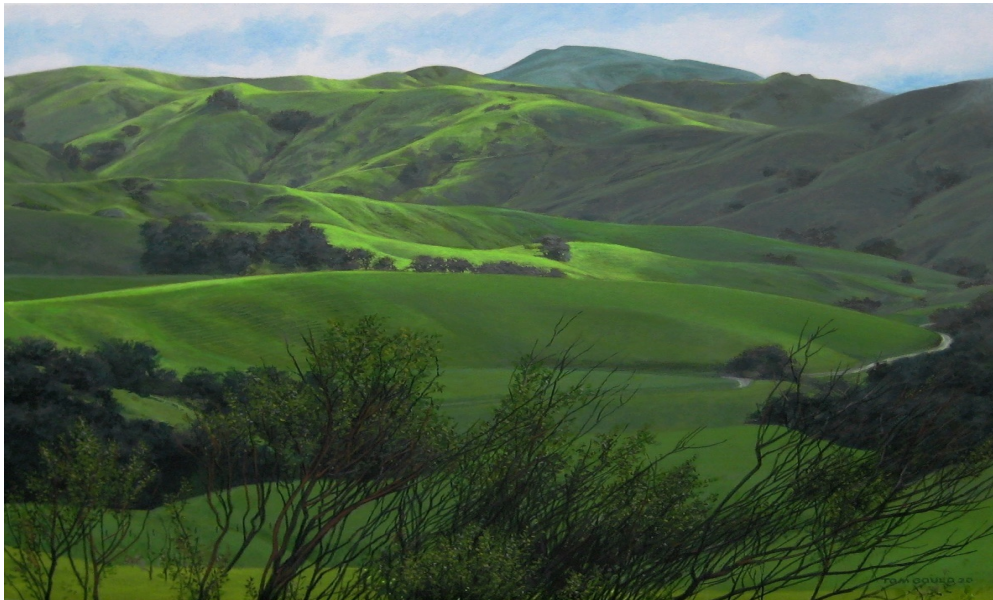
Rain Day by Tom Gould, acrylic, 16 x 20"

Samples of my work are available at https://cambriaarts.org/member-showcase/