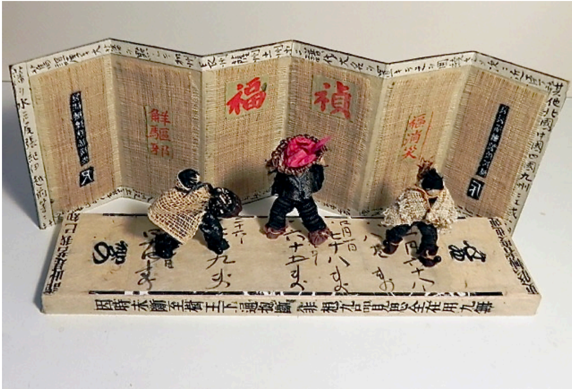
Edo Market Day, Part of the Japanese Workmen series. 12" x 8" x 6," Book form paper and mixed media

My mother and grandmother were both artists and at an early age, I began painting and creating art. I taught high school English and Social Studies in the Bay Area and earned my Master's Degree in Education from UCLA.