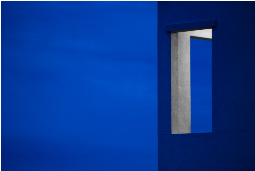
Blue Morning by Kathleen Bosch