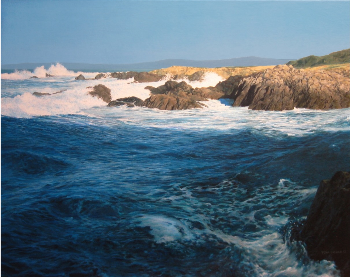
Asilomar Cove, acrylic, 16 x 20"

My degree was in fine arts from San Diego State, and over forty years as a graphic designer/illustrator I came to specialize in publication design, including seven years at Psychology Today magazine as Art Director.