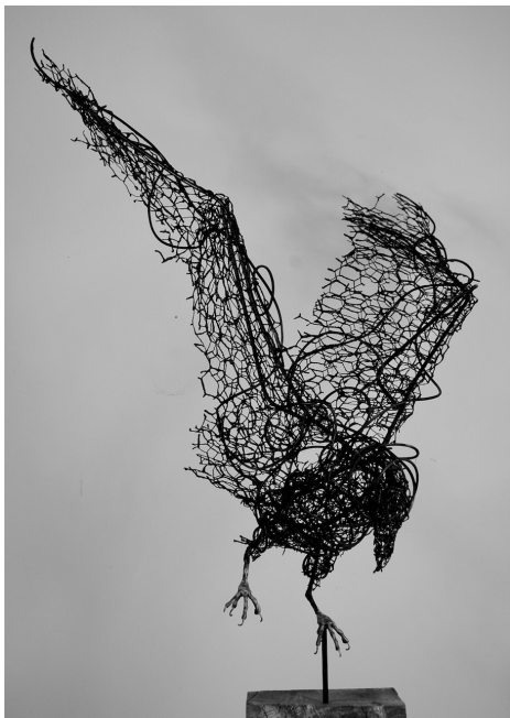
Black Wire Raven by Mike Hannon 26"H, 18"W, 18"D, chicken wire, steel

On and Off the Wall: Thanks to all who entered their art! Notifications of acceptance go out no later than July 15 th . Volunteers are needed to help with take-in, take-out, and the outdoors reception.