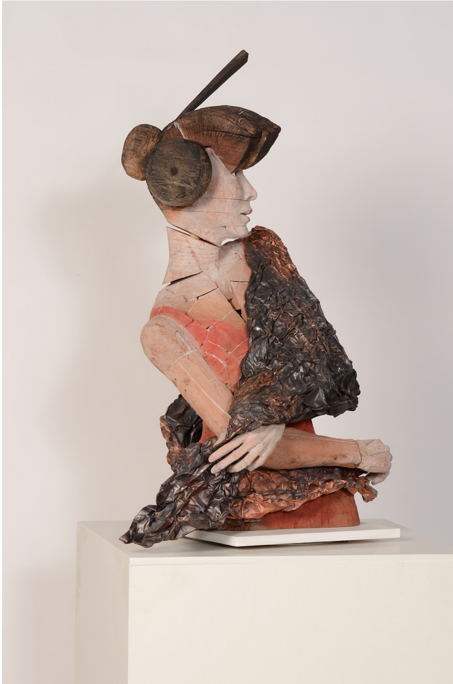
Mokume, 36"H, 24"W, 18"D, redwood, copper, acrylic