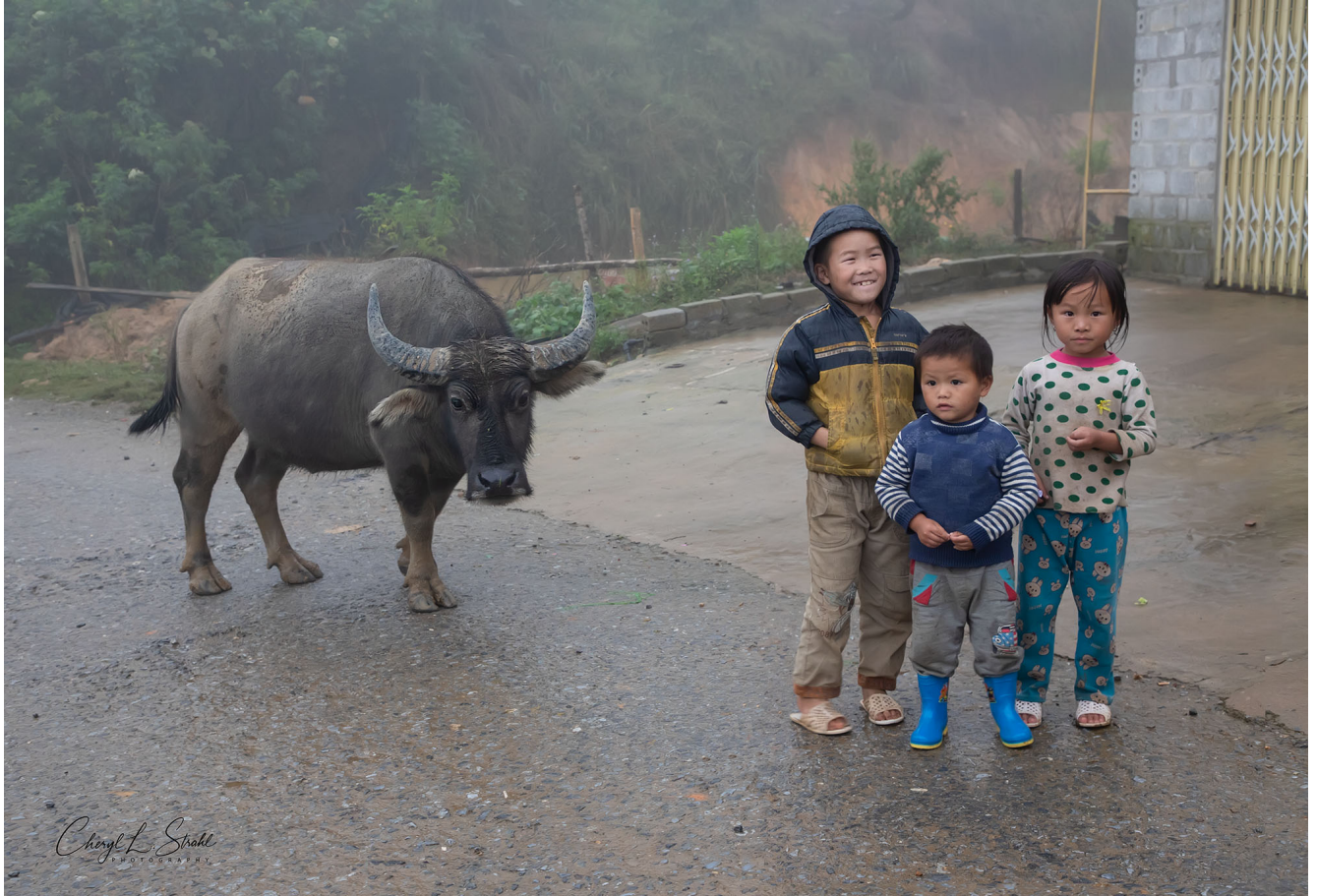
Kids with their Water Buffalo in the Rain

I love photographing life. Whether it's Hmong children in the rain in the village of Ma Cha in northern Vietnam, a polar bear family in the North Slope of Alaska, or a white lion in South Africa, I am happiest when capturing life in its natural environment. Often, I look for the story behind the images and find myself leaning toward photojournalism in my photography.