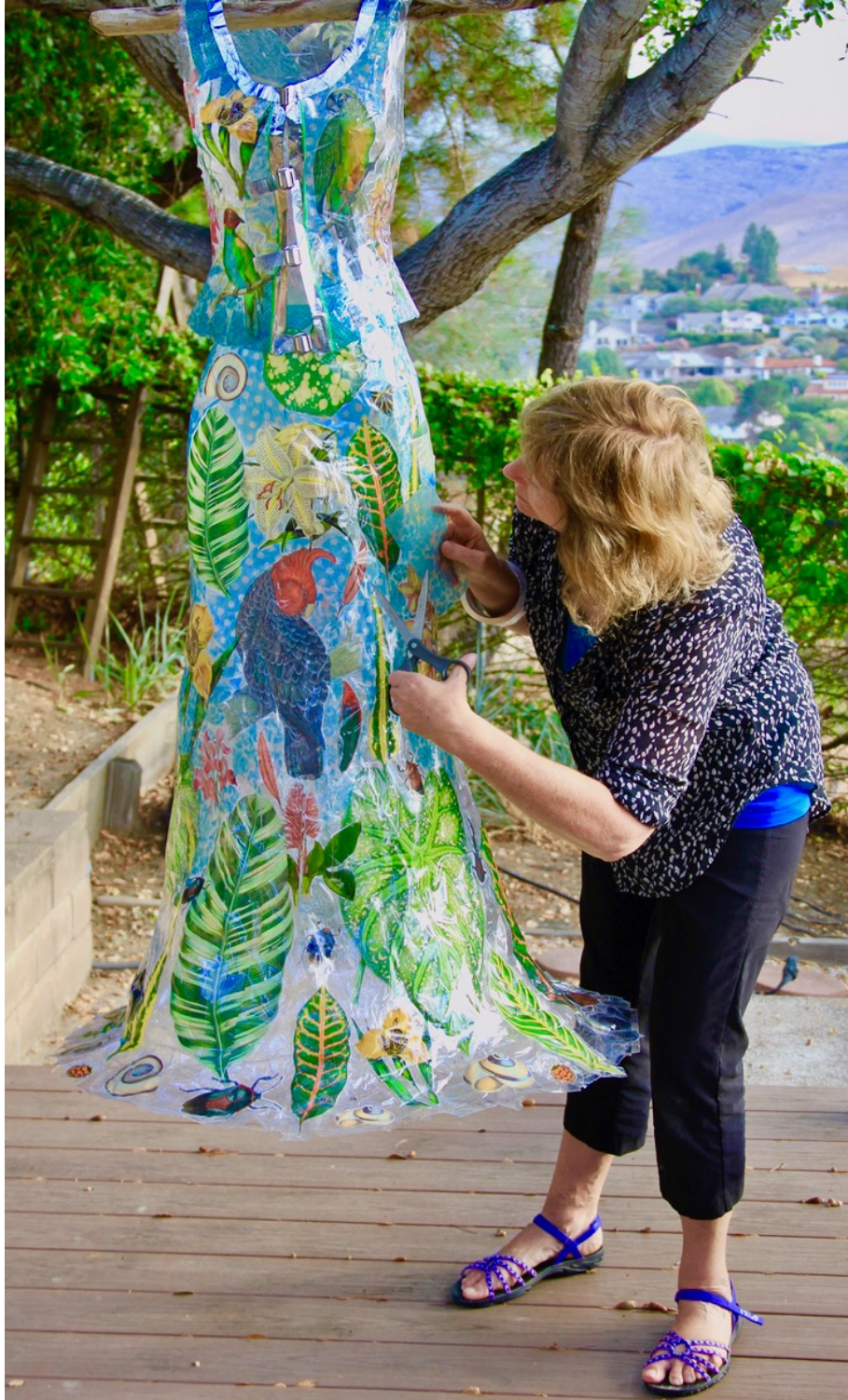
Frida's Dress, saran wrap, packing tape, image transfer; 65" x 30" x 30"