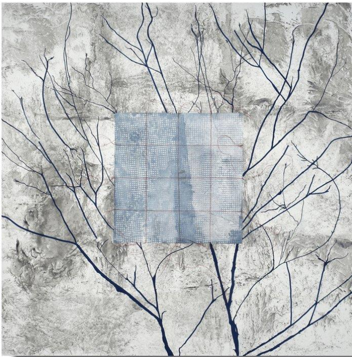
upRooted by Vicky Hoffman, mixed media (acrylic, oil-based pens, sewing thread, kozo paper), 30 x 30"

Vicky says, "I started this painting in March 2022 when Ukrainians were fleeing for their lives. At the same time, my potted aloe vera plant was blooming. I was having a hard time with the juxtaposition of new growth among the backdrop of failed humanity. It took about five months to complete. https://www.vickyhoffman.com