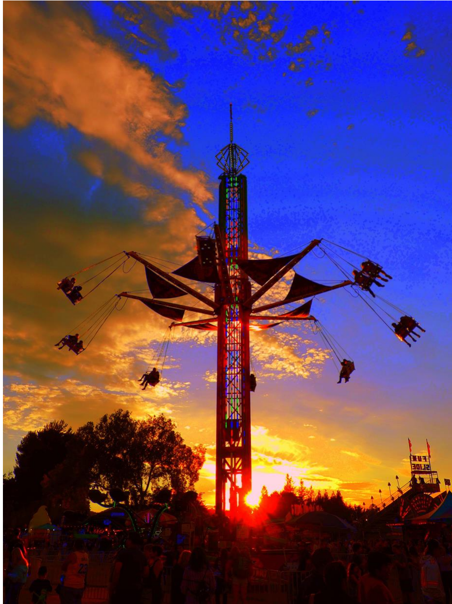
Having fun at the Fun Zone