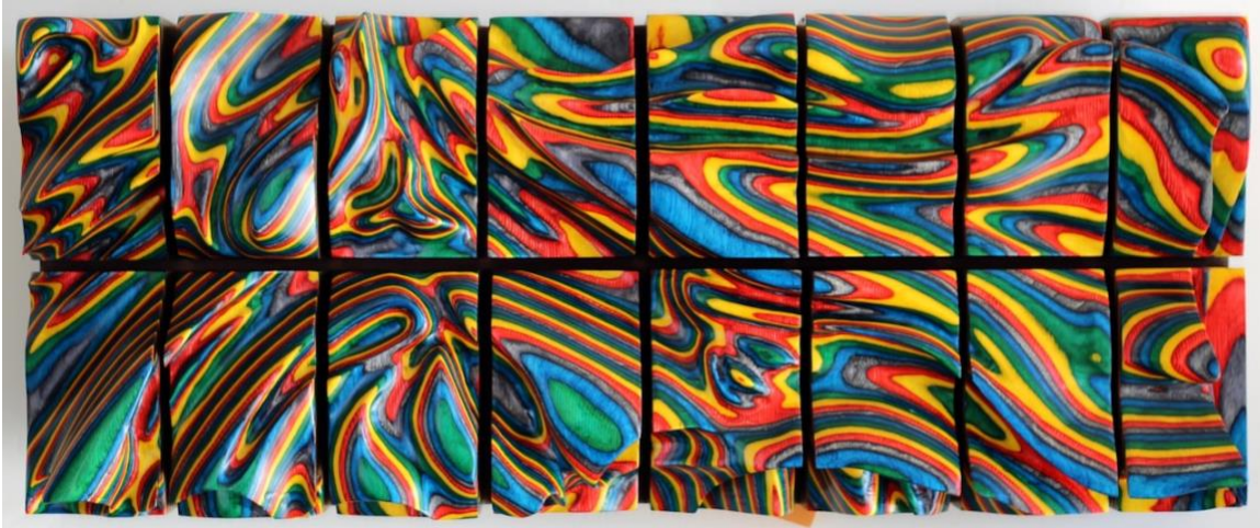
RainboPly by Ken Wilbanks, Spectraply (birch integrally dyed layered plywood), 10”h x 25”w x 4”d