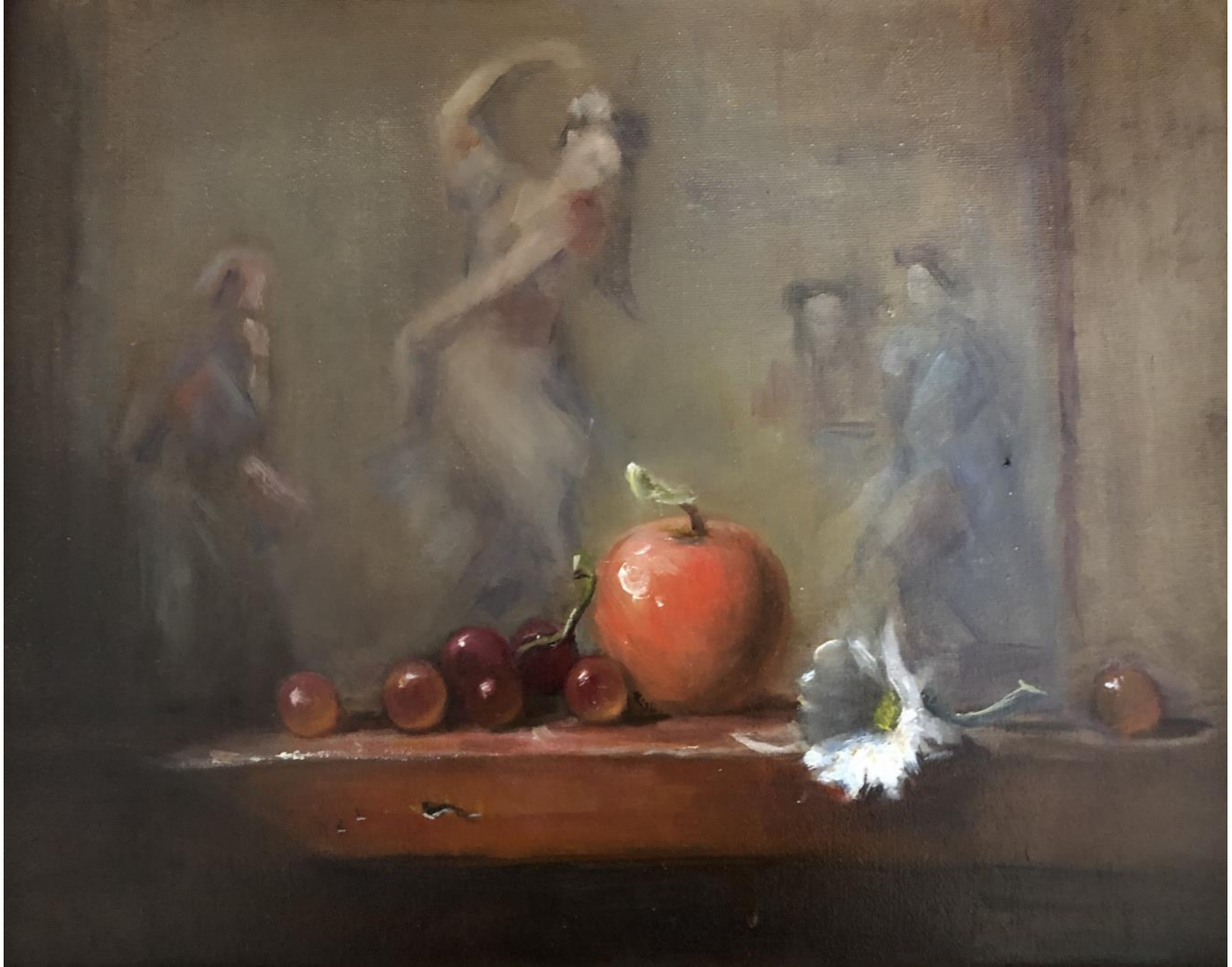
Still Life with Fruit, oil, 11 x 14"