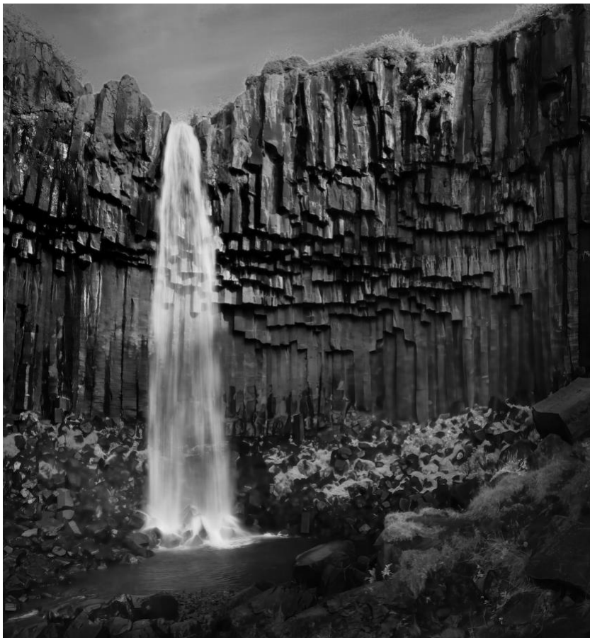
Black Falls by Jaye Pruett

San Luis Obispo Museum of Art: Nature of Acquaintance with work by 6 photographers. Through January 2. https://sloma.org/exhibits/ The Photo Society's Jaye Pruett says, "My photo is titled Black Falls , the English translation of the actual Icelandic name, Svartifoss, located in Skaftafell National Park in Iceland. The falls drop about 60 feet, cascading over and down basaltic rock columns. I took the photo in September during a wonderful trip around Iceland."