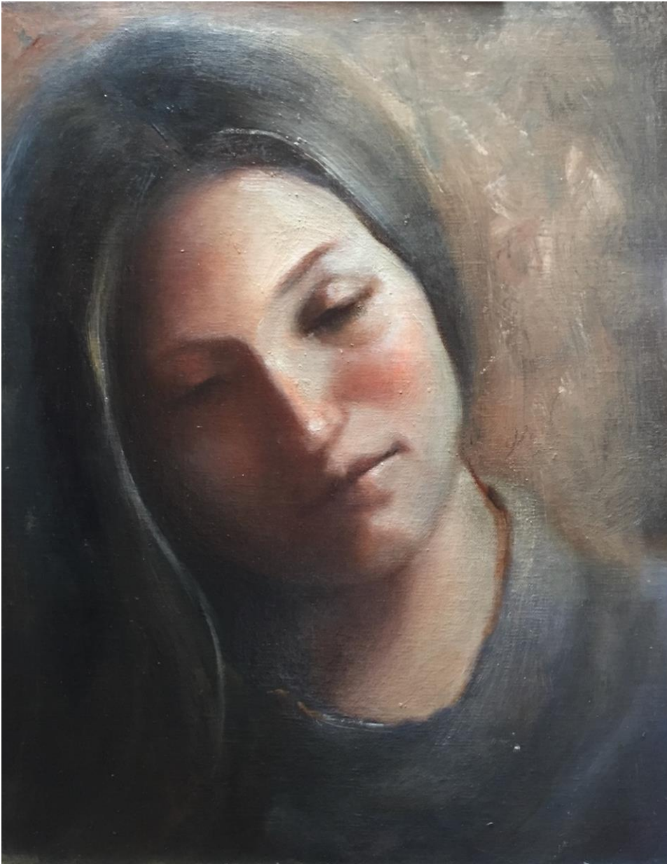
Sweet Dreams by Dianne Ravin, oil, 11 x 14"