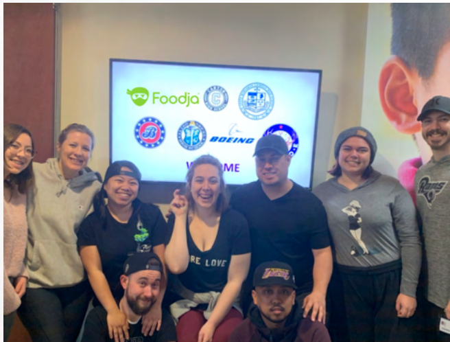
Foodja Volunteer Day at Second Harvest Food Bank

Through our support for the following two organizations, we're able to maximize our reach and impact our communities in ways that our employees and customers can be proud of.