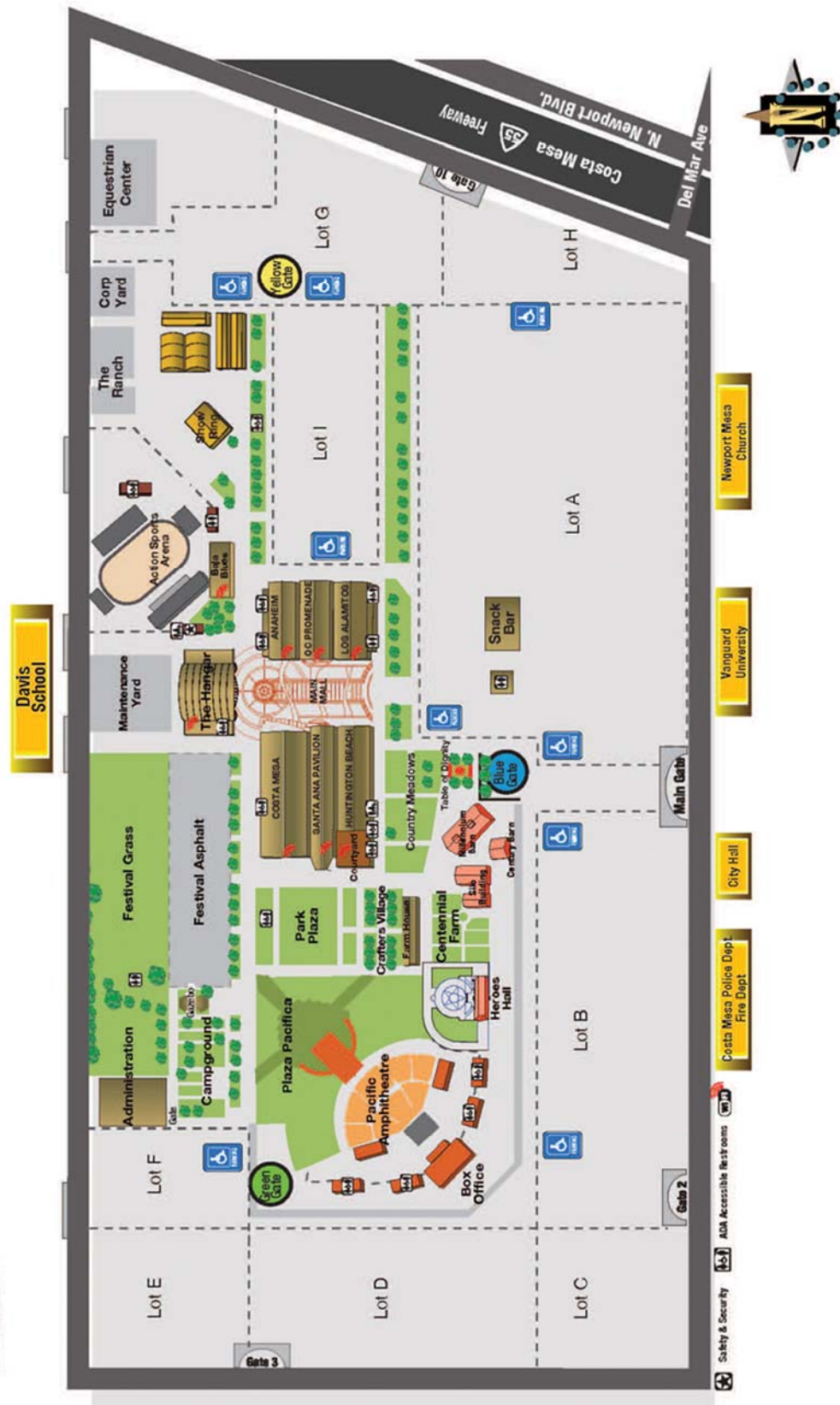
EXHIBIT A - FACILITY MAP