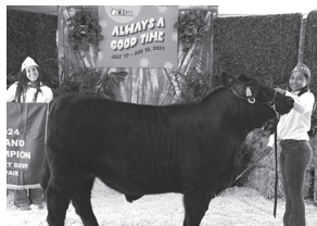
Grand Champion Market Beef Ava Steward-Puga Orange Acres Backbreakers 4-H Purchased By: Matthew from Orange, CA $14,000