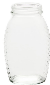
Queenline glass jar