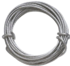
Multi-strand braided galvanized steel wire