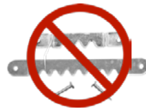
No sawtooth hangers