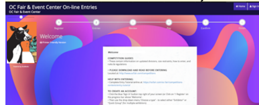
fairwire.com welcome page

The numbered steps along top of page are clickable and show the current section you are on