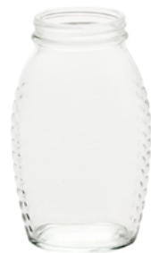
Queenline glass jar