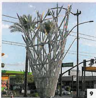
6. Mesa Arts Center's shade sails. 7. Lulubell has many toys that can't be found elsewhere in the States. 8. República Empanada. 9. The Mesafflora art installation sits alongside Mesa's new light-rail line.

Greg Sorrels opened The Beer Research Institute , Mesa's latest entry into the Valley's bustling craft brewery scene. Their popular Belgian-style Lolli—an approachable 8 percent brew—was so called, they joked, because it had “notes of banana lollipop.” Form your own hypotheses over a flight beneath the bar's laboratory flask-shaped lights. On downtown's Main Street, Desert Eagle Brewing