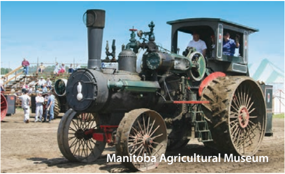
Manitoba Agricultural Museum