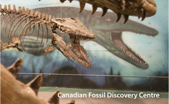
Canadian Fossil Discovery Centre