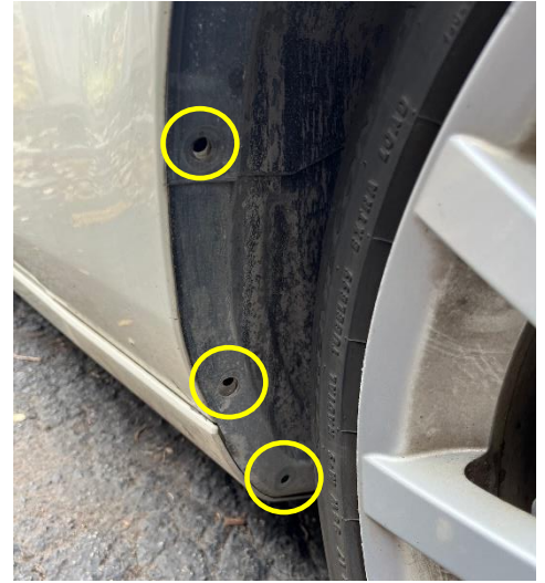
Wheel turned for fender liner hardware access