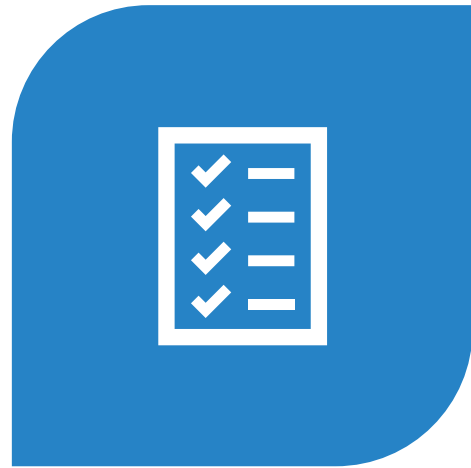
WEST TOE BUTTRESS WORK PLAN