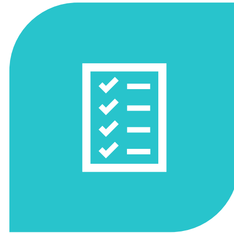
LEACHATE AERATION WORK PLAN