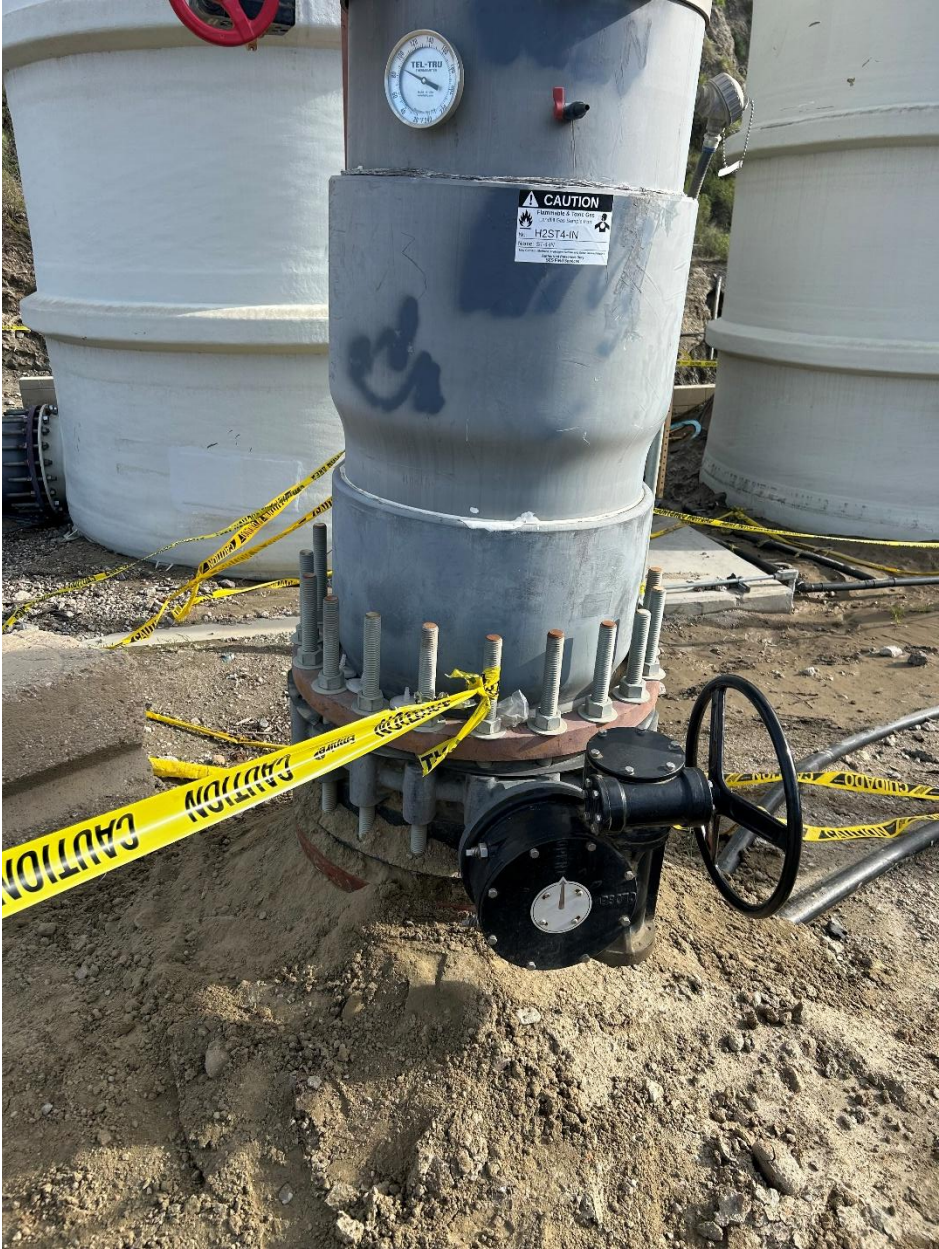
H2S Vessel 4