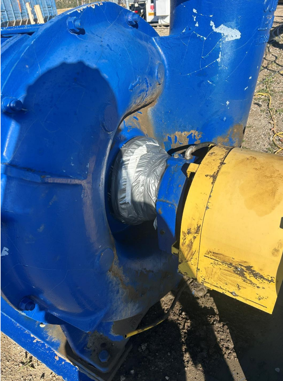
Zeeco Blower housing