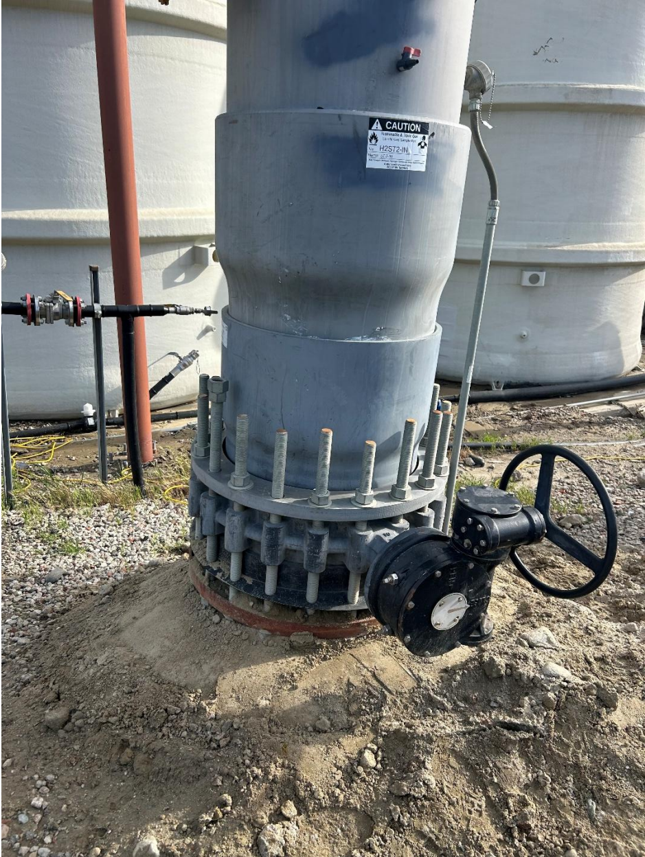
H2S Vessel 2