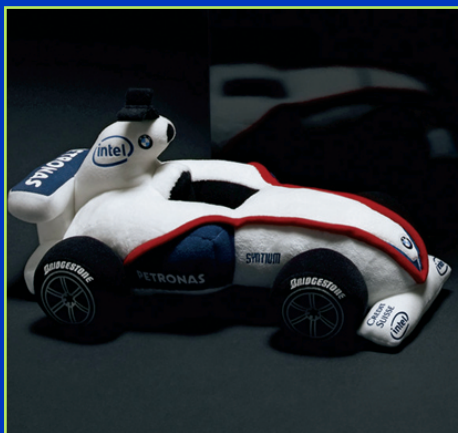
F1 Furry Car Item: 80 30 0 442 223