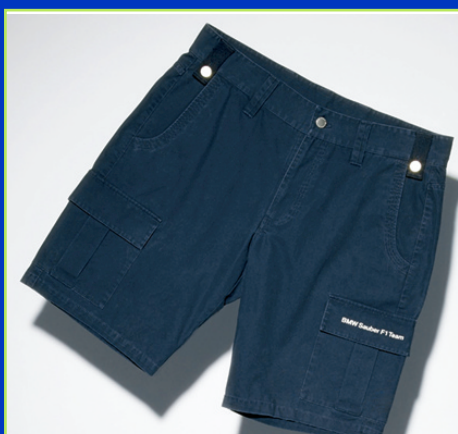
Men's Bermuda Shorts Item: 80 30 0 433 785-789