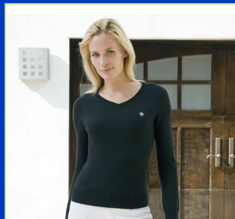
Ladies V-Neck Sweater Item: 80 14 2 149 792-796