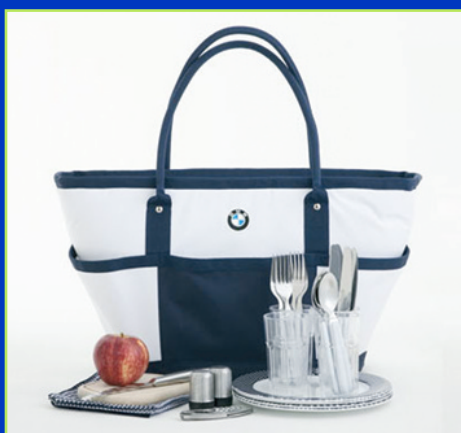
Picnic Tote Item: 80 23 2 148 742