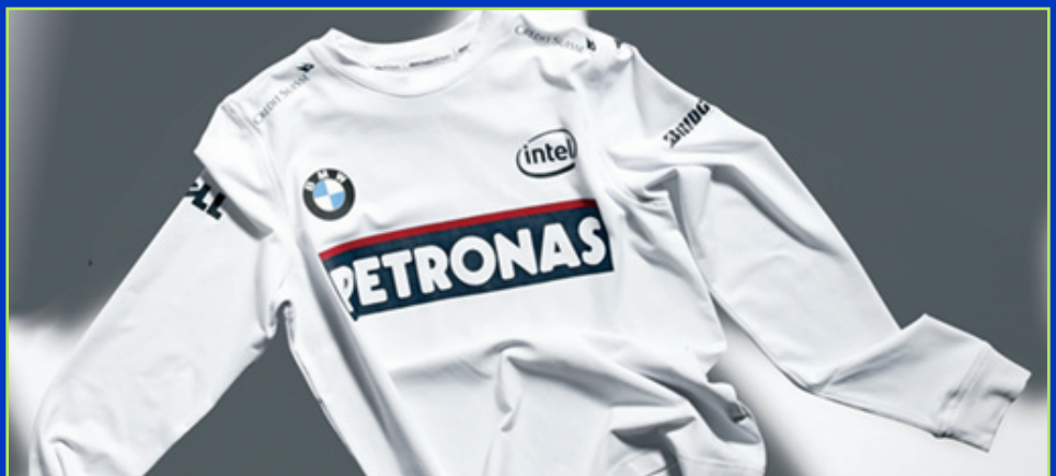
Junior Pit Crew Item: 80 30 0 433 915-919