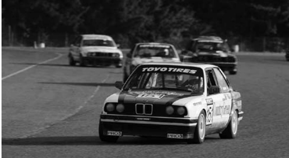
Jeff the 2008 PRO3 champ.