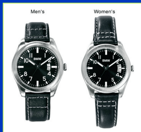
NEW Classic Watch Item: 80 26 2 150 001-002