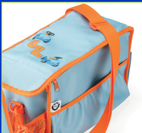
Back Seat Tote Item: 80 23 0 408 574

You may find these gift items at your local BMW dealer. If they are not in stock, the item number is shown so they may be ordered. Happy Holidays!