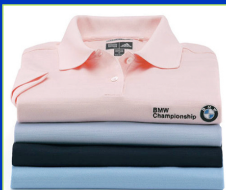
Ladies ClimaCool Textured Mesh Polo Item: 80 13 0 037 171-186