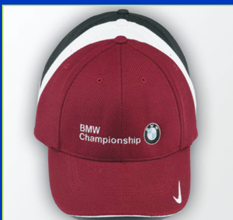
Flex Fit Cap Item: 80 16 0 037 121-123