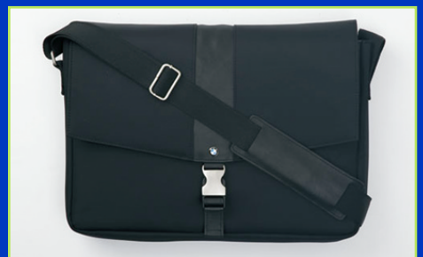
Laptop Messenger Bag Item: 80 22 2 149 864