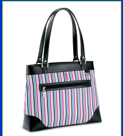
Striped Handbag Item: 80 23 0 445 425