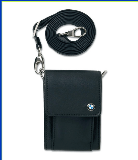
Camera Case Item: 80 21 2 147 933