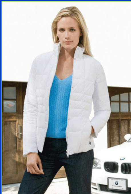
Quilted Jacket Item: 80 12 2 149 832-836