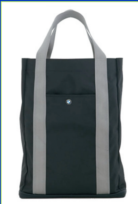
Market Tote Item: 80 22 2 149 861