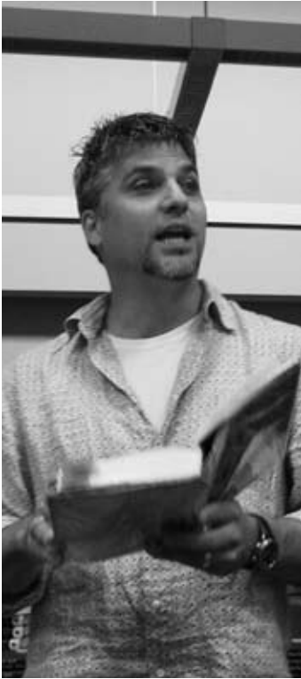
Garth Stein reading to Club members at University Bookstore.