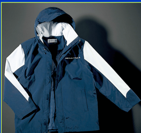
Men's Long Jacket Item: 80 30 0 433 775-779