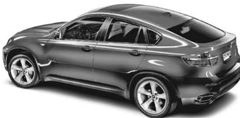
BMW X6 xDrive35i A coupe above. Starting at $52,500 MSRP Twin-turbo direct injection inline 6-cylinder 300 horsepower xDrive, intelligent all-wheel-drive 20 mpg hwy*

Pick up your kids in one of these and they may admit they actually know you.