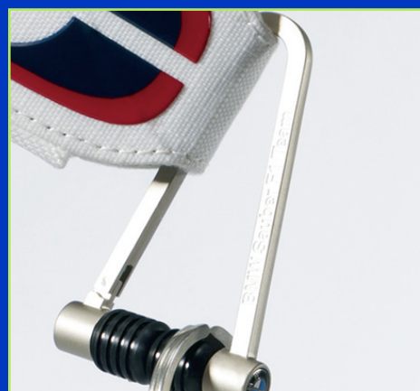
Key Ring Carabiner Item: 80 30 0 433 978