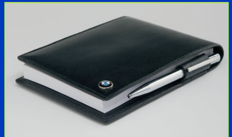
Jotter Pad Item: 80 21 2 149 860