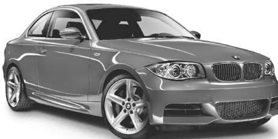
BMW 135i Coupe The new look of fast. Starting at $34,900 MSRP 3.0-liter, turbocharged inline 6-cylinder engine 300 horsepower Rear-wheel drive 25 mpg hwy

Special lease and finance rates are available through BMW Financial Services.