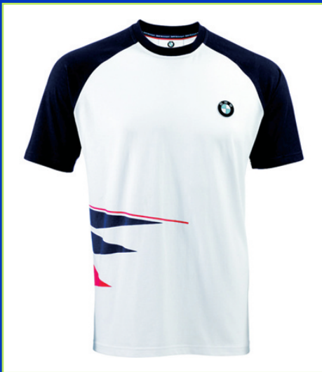
Men's Motorsport T-Shirt Item: 80 30 0 432 975-979