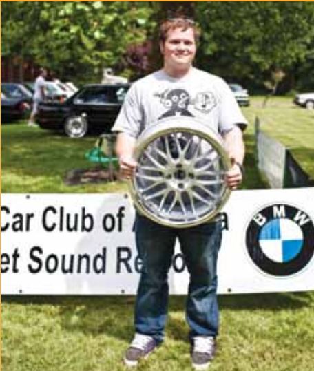
Happy winner of a set of wheels donated to the raffle from Bavarian Autosport and Bayern Wheels.