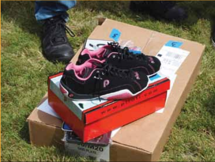
Mac's pile of raffle winnings!