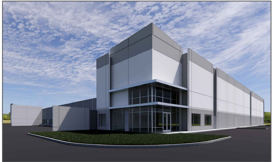
Sample Building Image