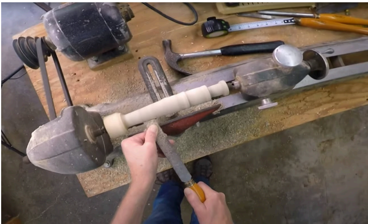
Turning on the lathe

For some reason, that lathe and scroll saw held a special significance to him, perhaps simply because he bought them in his late teens. So when he gave them to me in the mid-2000s I felt the weight of their importance. Dad kept these tools for all these years and had bestowed them upon me, so I felt obligated to cherish them, too. I built a workbench on which I mounted both tools, along with a system for swapping the motor and belts between them.