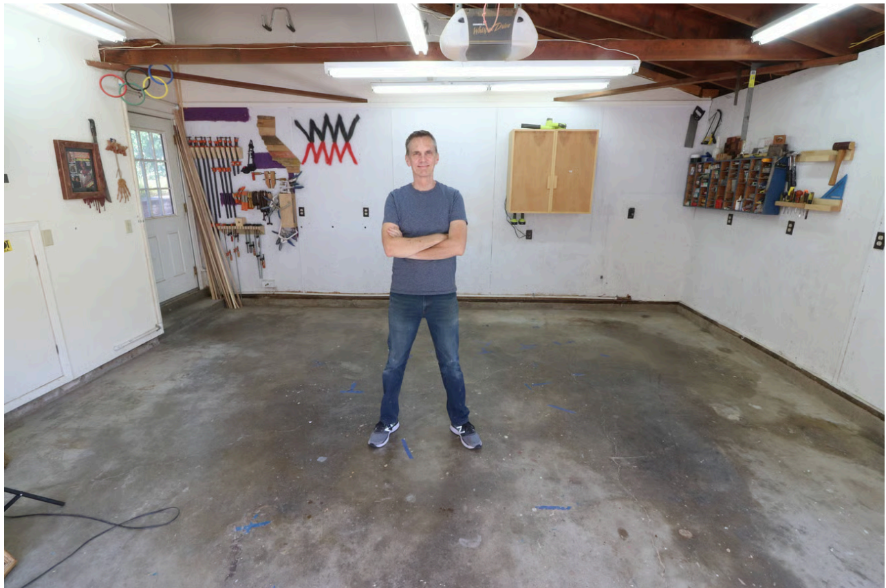
Making some kind of dramatic point back in 2018

I'm not suggesting we all stop buying tools or pare down our shops to a single chisel and a hand saw, but we can learn to be more savvy with our purchases and be smarter about why we are consuming. It's good for our wallets as well as the planet.