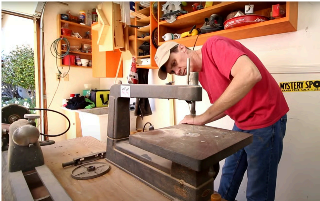
My dad's scroll saw

In my storage unit are two tools that my dad bought in the 1950s and that he gave to me 20 years ago: his lathe and his scroll saw. Long-time viewers of my show will recall a few projects I turned on the lathe and a few decorative items I made with the scroll saw.