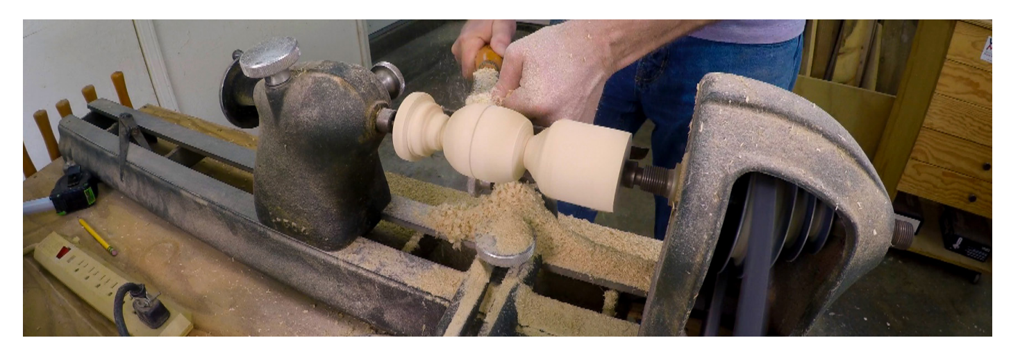
Turning wood on my antique lathe (Lathe not required in The Weekend Woodworker Course).

And don't forget that you have another option: to buy used tools. Unlike tech gear, power tools don't fundamentally change over the years and become obsolete. On my show, you've probably seen me use a lathe that my dad purchased over 60 years ago. It's quirky, doesn't have a digital readout, and takes longer to set up than a newer lathe. But the basic function is the same: it's a motor that spins something. This is the basic functionality of almost all power tools. My lathe is capable of producing the same results as a brand new $2,000 unit. Plus it's pretty cool being able to use my dad's old tools.