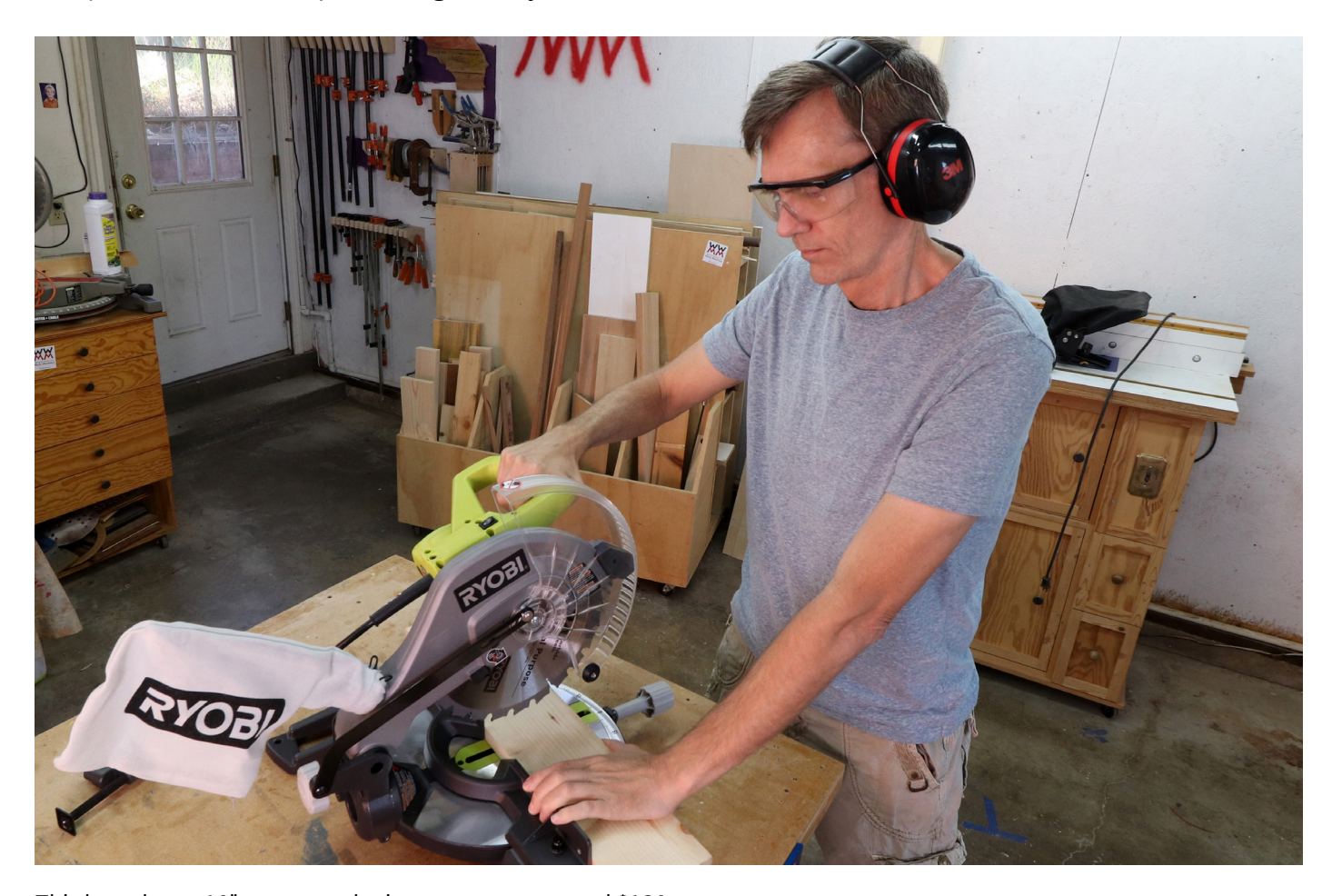
This brand new 10" compound miter saw costs around $120.

If you're buying new tools, start out with what I call "hobbyist grade" tools. These are affordable brands that cater to weekend woodworkers. Ryobi is a respected brand that sells tools for half of what other brands charge, and they're readily available at your local Home Depot. (I have been using my Ryobi drill press for over 15 years!) Harbor Freight is another retailer that specializes in inexpensive tools. They will all get the job done.