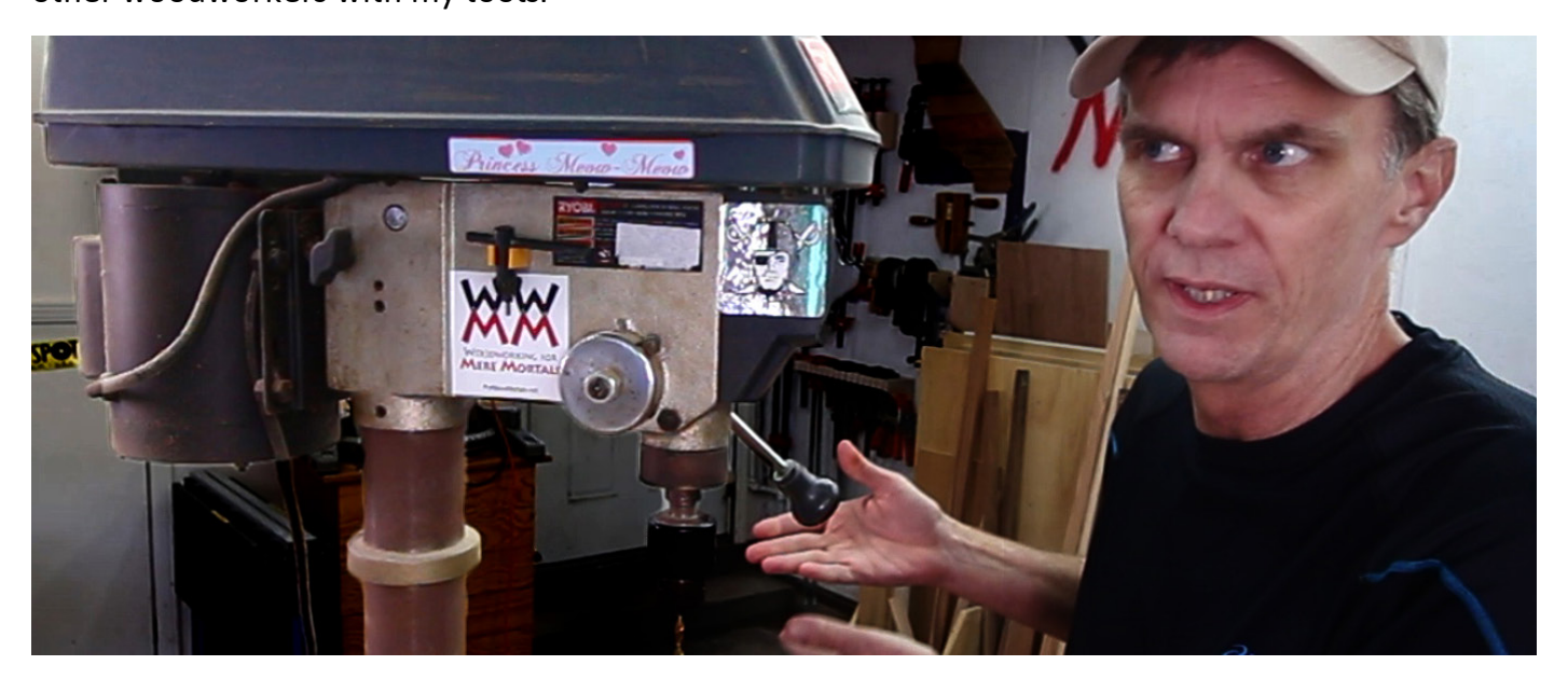
I've been using this "entry level" drill press for over 15 years. It ain't pretty, but it still gets the job done! (Drill press not required in The Weekend Woodworker Course)

Since then, I have gotten rid of more tools than I have purchased. Which ones do I keep? Only the ones I use on a regular basis. My goal is to have fun building useful projects, not try to impress other woodworkers with my tools.