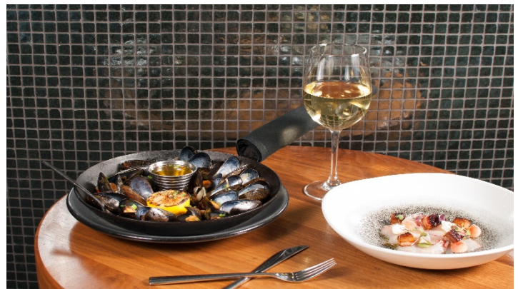
Mussels a la Plancha and Hiramasa Crudo, ZuZu Restaurant