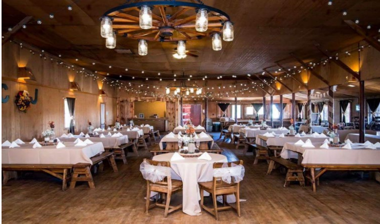
Banquet Hall, Mormon Lake Lodge

Mormon Lake Lodge offers groups two-for-one pricing on cabin rentals during midweek (Sunday through Thursday) for spring and summer 2019. Every night booked would include a second night at no charge. Choose from a variety of cabins ranging from $59 - $324 per night. The Lodge is situated on 300 acres of pristine forest that offer flexible facilities and amenities for corporate meetings, family reunions, retirement parties, weddings, group functions, and team-building events.