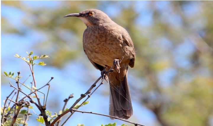
Curved Bill Thrasher

The Arizona office of the National Audubon Society science review team approved a third Camp Verde Important Bird Area (IBA) . The IBA designation acknowledges the biodiversity of the area and the value it has to bird conservation. The recognized area includes the 17-mile corridor of the Verde River, plus West Clear Creek and Wet Beaver Creek, within the corporate boundary of Camp Verde. The Verde River's vast watershed is habitat for one of the largest concentrations of resident and migratory birdlife anywhere in the Southwest. This new area brings a total of six IBAs to Yavapai County.