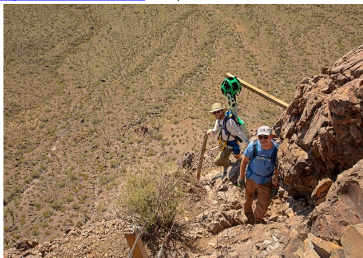
Arizona State Parks & Trails employees carrying Google R7 Trekker