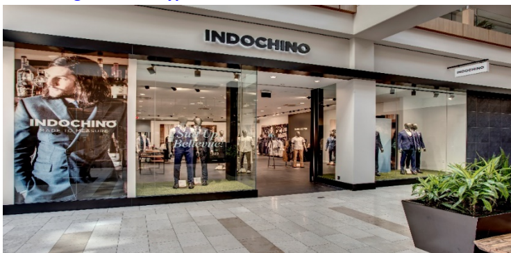
INDOCHINO, store front