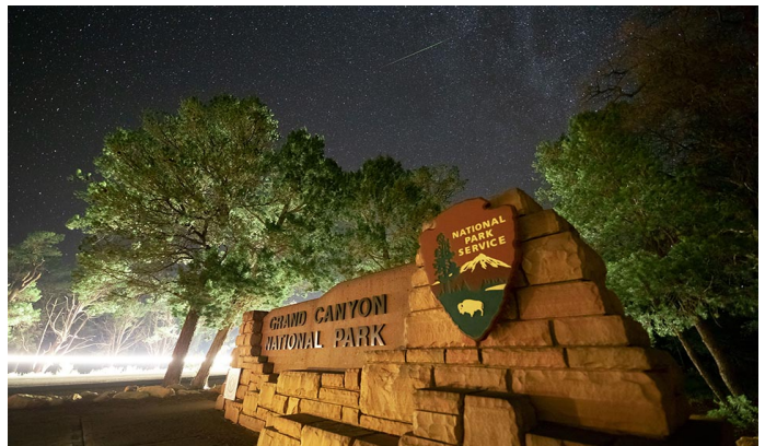
Grand Canyon Park