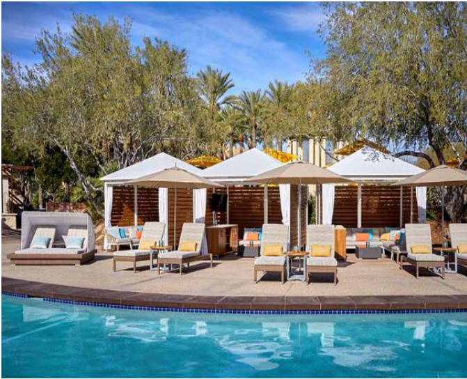
Pool, JW Marriott Desert Ridge

The JW Marriott Desert Ridge Resort & Spa announced a " Splash Into Summer " deal that includes a $50 resort credit, a $10 donation to Phoenix Children's Hospital, and resort fee (which includes high speed internet, two comp hours of pickleball, comp use of driving range, tennis courts and two hour bike rental). Prices start at $199 and are available May 23 – Sept. 7, 2019. Must use promo code SPU when booking. JW Marriott Starr Pass Resort & Spa in Tucson unveiled