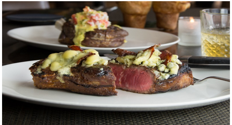
Lincoln, JW Marriott Camelback Resort & Spa