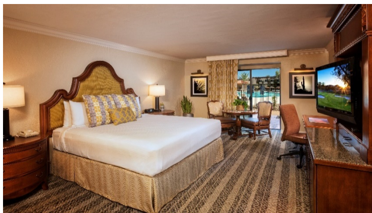
King Suite, Scottsdale Resort at McCormick Ranch