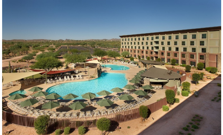
Pool at We-Ko-Pa Resort & Conference Center

We-Ko-Pa Resort & Conference Center announced their one and two-night summer staycation packages . A one-night stay includes a deluxe guest room with one king or two queen beds, $25 food and beverage credit, one $10 casino slot play, 25% off regular priced spa services, and a waived $25 resort fee. Prices start at $99, not including taxes. A two-night stay includes a deluxe guest room with one king or two queen beds, $75 food and beverage credit, one $10 Casino slot play, 25% off regular priced spa services, and waived $25 resort fee, per night. Prices start at $189, not including taxes. The summer staycation packages are available May 1 – Aug. 31, 2019.