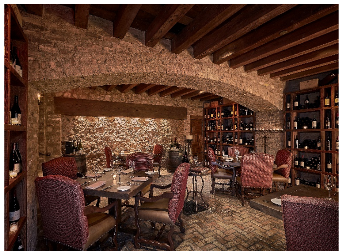
LON's Wine Cellar, Hermosa Inn