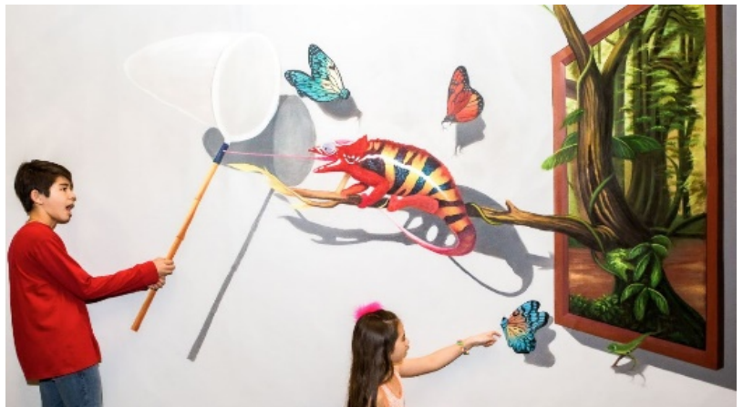
'Surprise Your Eyes' at Odyssey in the Desert