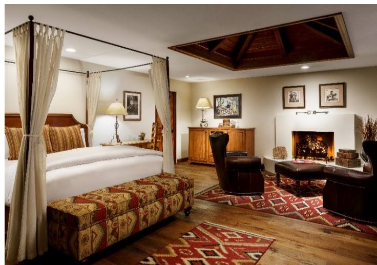
King Suite, Hermosa Inn