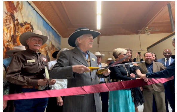
Grand Opening, Western Heritage Center

The new Western Heritage Center in Prescott is a unique collaboration of more than 25 organizations, including museums, historical societies and other related organizations that promote Arizona's western heritage. Independent exhibits featuring the Rough Riders, ranching, railroad, film history, mining, and more will also be included, enhancing the Center's attraction. The Western Heritage Center, located across from the Courthouse Plaza on Montezuma Street, will engage with its visitors, educating and bringing to life the area's rich heritage and history. Later this year, interactive touch screens will encourage visitors to learn more about each organization's history and mission, while also offering directions to their locations.