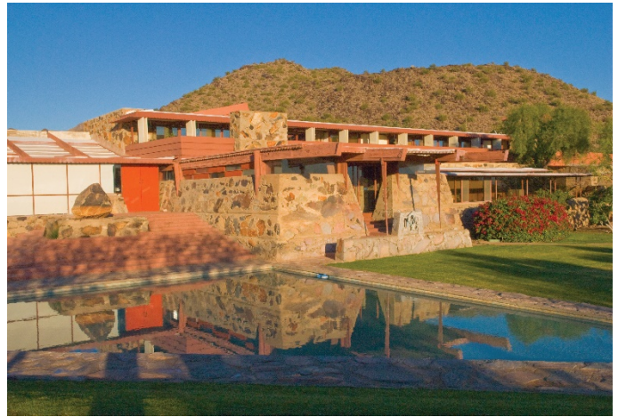
Taliesin West, Scottsdale