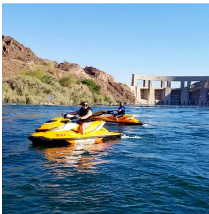
Parker Watercraft Rentals

Parker Watercraft Rentals , the family-owned and operated personal watercraft company on the Parker Strip, announced their spring hours and rates. Pending water levels, patrons are invited to enjoy the Parker Strip with Parker Watercraft Rentals starting at just $250 per day, plus tax and gas. Full day rentals are available 8 a.m. - 6 p.m. and include life jackets, all safety equipment, anchor, and dock line.