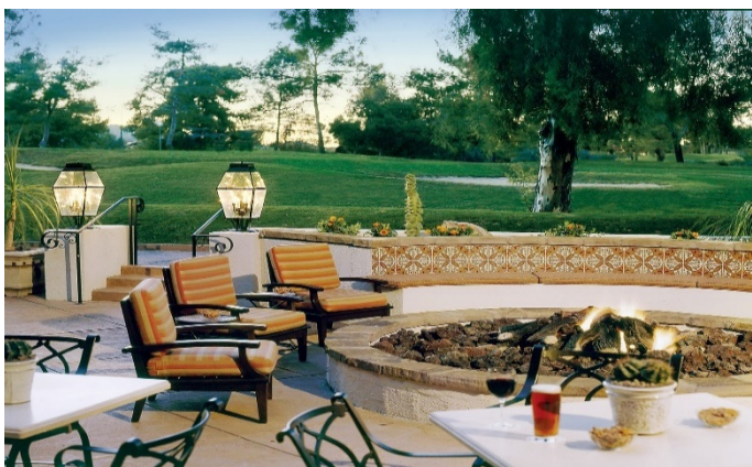
Golf Course Patio, Scottsdale Resort at McCormick Ranch