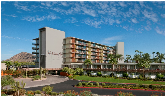
Front Entrance, Hotel Valley Ho