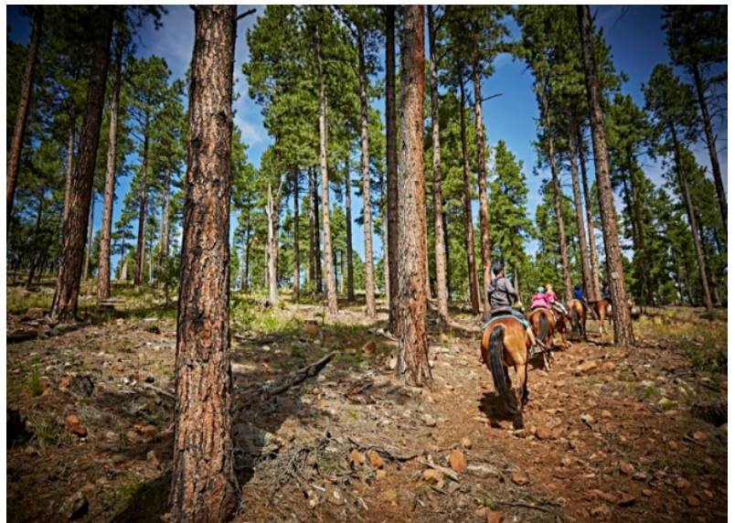
Guided Horseback Ride, Mormon Lake

Located southeast of Flagstaff, Mormon Lake Lodge announced their midweek “Giddyap Mountain Getaway” summer packages. There are three packages to choose from, each include a horseback-riding excursion, a meal and an overnight stay in a Mormon Lake Lodge cabin for two. Sunrise Mountain Saddle Up package offers a one-night cabin for two, a 1.5-hour guided horseback ride at 7:30 a.m., and breakfast at 9 a.m. The room rate is $198 plus tax and $55 per person for an additional person in the same cabin, and $45 per person for an additional one-hour horseback ride. Chow Time Late Morning Ride package offers a cabin for two, a two hour guided horseback ride departing at 9:45 a.m., and lunch in the lodge. The room rate is $239 plus tax and $72 per person for an additional person in the same cabin, and $45 per person for an additional one-hour horseback ride. Dinner Bell Afternoon Ride package offers a one night cabin for two, a 1.5-hour guided horseback ride at 4 p.m., and dinner at the steakhouse. The room rate is $229 plus tax and $72 per person for additional person in same cabin, and $45 per person for an additional one-hour horseback ride. Guests can add an additional night to any summer package for $98 per night.