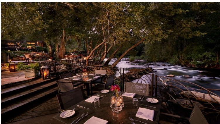
Cress on Oak Creek, L'Auberge