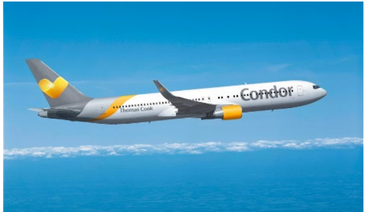
Boeing 767-300ER, Condor Airlines

PR Contact: Sky Harbor Media Inquiries Phone: (602) 273-3300 Email: skyharborPIO@phoenix.gov