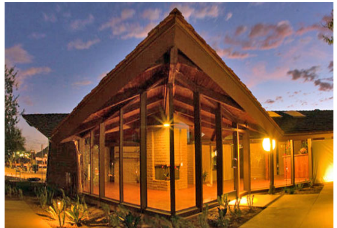
Sandra Day O'Connor House

The National Park Service has officially listed the Sandra Day O'Connor House in Tempe in the National Register of Historic Places . The nomination was prepared by the State Historic Preservation Office and was unanimously approved by the Arizona Historic Sites Review Committee on March 22, 2019. The National Register of Historic Places is the nation's list of properties considered worthy of preservation. Justice O'Connor resided in the house from 1958 until 1981. The home was the center of O'Connor's life during her ascent to the pinnacle of the judiciary. While living there, she endured discrimination in the 1950s and early 1960s when no law firm in Phoenix would hire a woman, raised her three sons, established herself as an attorney and judge, and then rose to become the first female Supreme Court Justice. O'Connor's home became a regular gathering place for Arizona's most influential individuals.