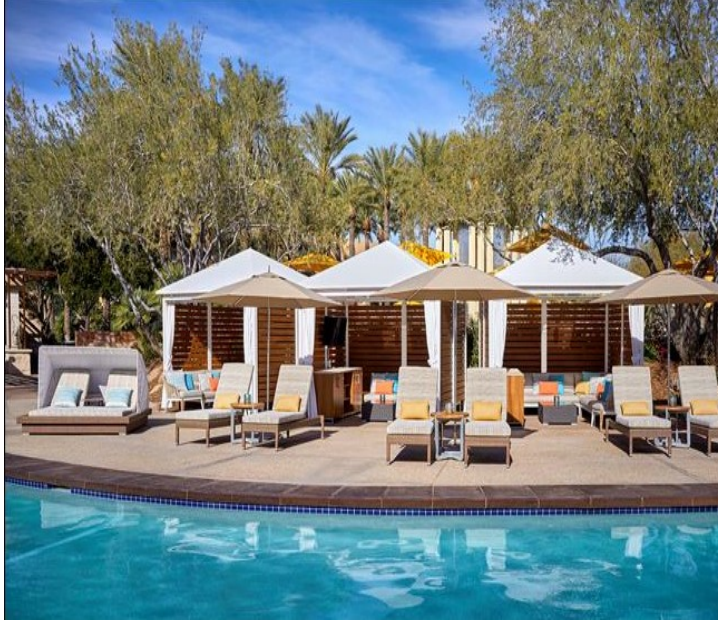
Pool, JW Marriott Desert Ridge