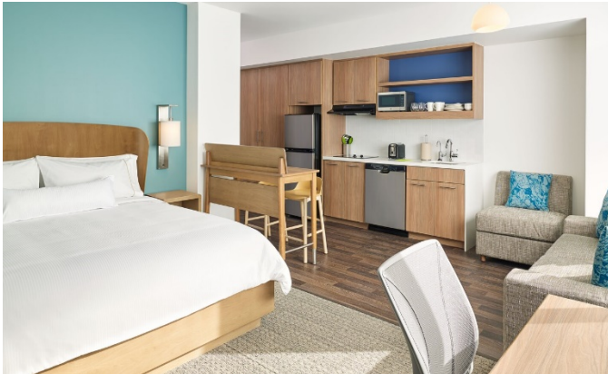
King Suite, Element Hotel