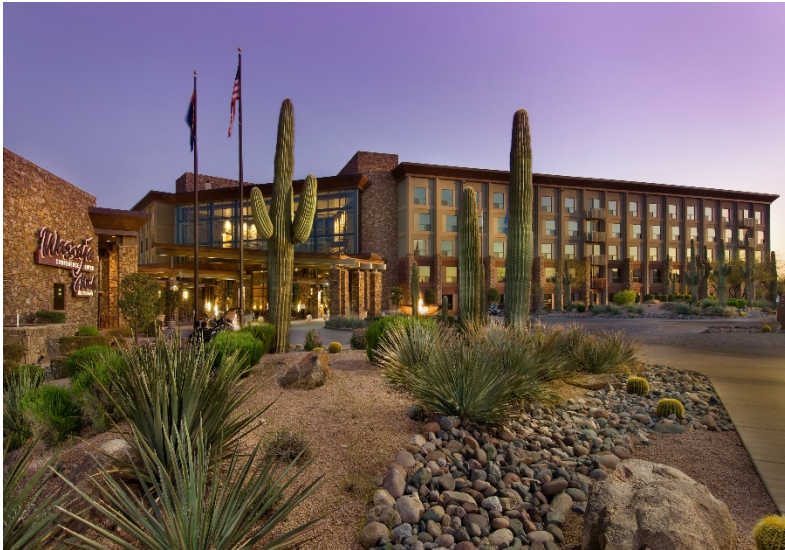
We-Ko-Pa Resort & Conference Center