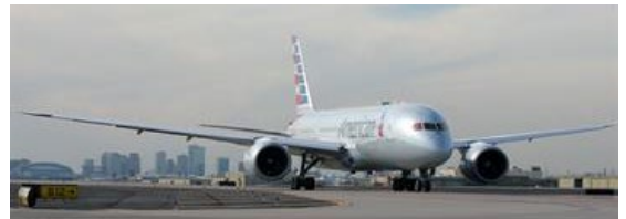
American Airlines, Phoenix Sky Harbor

American Airlines announced plans for additional growth in Phoenix with the addition of four new winter seasonal routes. So far this year American has announced 11 new destinations from Phoenix Sky Harbor International Airport (PHX). On December 18, 2019, American will launch service from Fort Lauderdale International Airport (FLL); Colorado Springs Airport (COS); Hector International Airport (FAR) in Fargo North Dakota; and Cincinnati/Northern Kentucky International Airport (CVG).