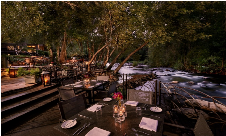
Cress on Oak Creek, L'Auberge