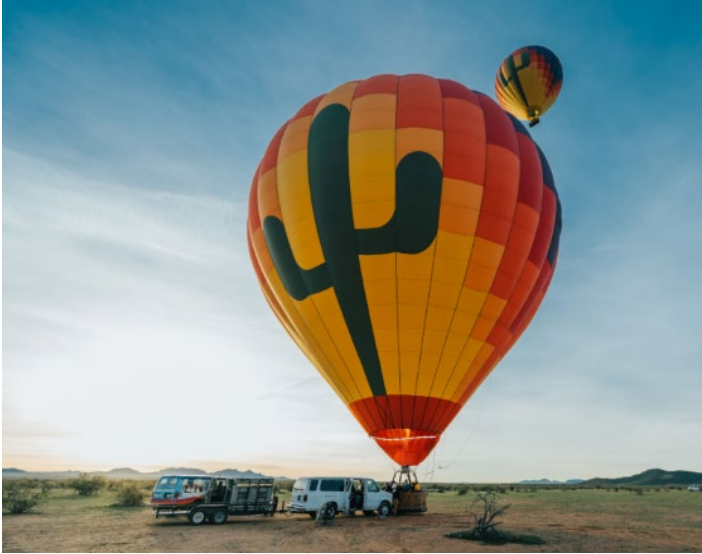
Hot air balloon, Hot Air Expeditions