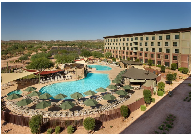
Pool at We-Ko-Pa Resort & Conference Center

We-Ko-Pa Resort & Conference Center announced their one and two-night summer staycation packages. A one-night stay includes a deluxe guest room with one king or two queen beds, $25 food and beverage credit, one $10 casino slot play, 25% off regular priced spa services, and a waived $25 resort fee. Prices start at $99, not including taxes. A two-night stay includes a deluxe guest room with one king or two queen beds, $75 food and beverage credit, one $10 Casino slot play, 25% off regular priced spa services, and waived $25 resort fee, per night. Prices start at $189, not including taxes. The summer staycation packages are available May 1 – Aug. 31, 2019.