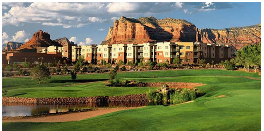
Hilton Sedona Resort at Bell Rock