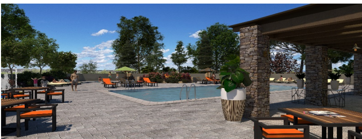
Pool Deck, Verde Ranch RV Resort