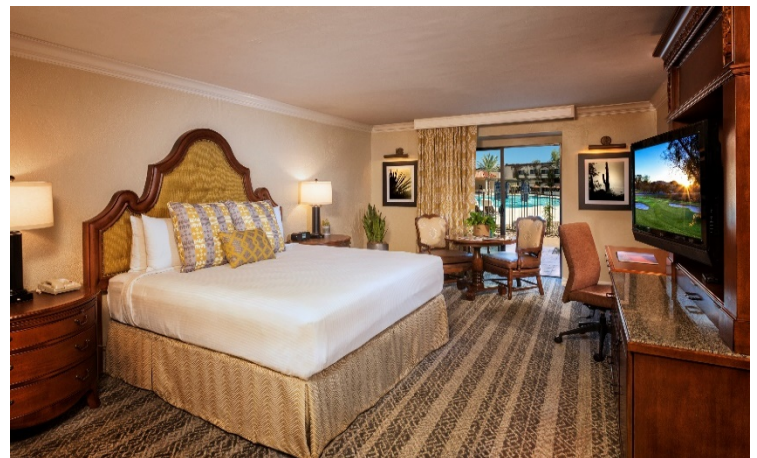
King Suite, Scottsdale Resort at McCormick Ranch