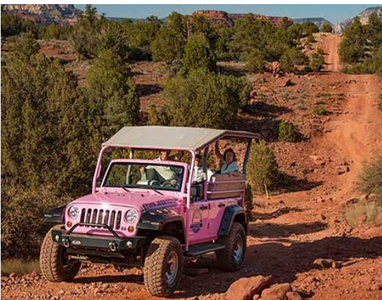
Diamond Gulch Tour, Pink Jeep Tours