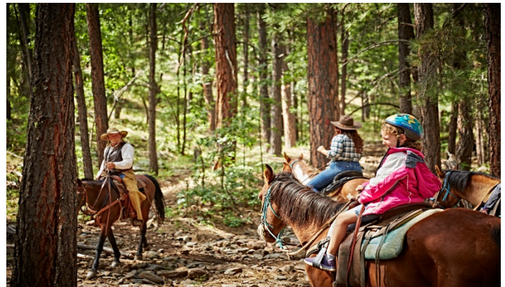
Guided Horseback Ride, Mormon Lake