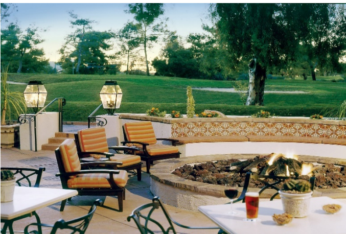
Golf Course Patio, Scottsdale Resort at McCormick Ranch