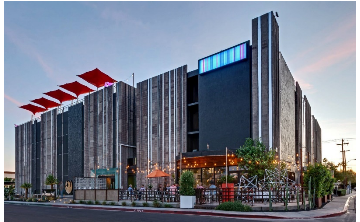
Clarendon Hotel and Spa

GreenTree Hospitality Group, Inc. announced the addition of GreenTree's first boutique collection property — The Clarendon Hotel and Spa . The four-star boutique hotel located in Downtown Phoenix offers several room options, including Deluxe Room, Junior Suite and Pool View Suite. This marks the eleventh property in the brand's U.S. portfolio. The Clarendon Hotel and Spa's amenities include The Clarendon Spa, the Oasis Pool, featuring a silver-coated water wall, six outdoor cabanas, and a 50-person hydro spa. Recent property upgrades include the exterior's southwestern landscaping, the contemporary building exterior, modern art, a coffee shop, and Tuft and Needle mattresses in every room. For dining, and events and meetings, the property has a full-service food and beverage outfit called Tranquilo, a vibrant mod-Mex catina; several meeting rooms; and SkyDeck, a rooftop bar/hangout space, which provides guests and customers spectacular views of Phoenix's skyline and surrounding mountains.