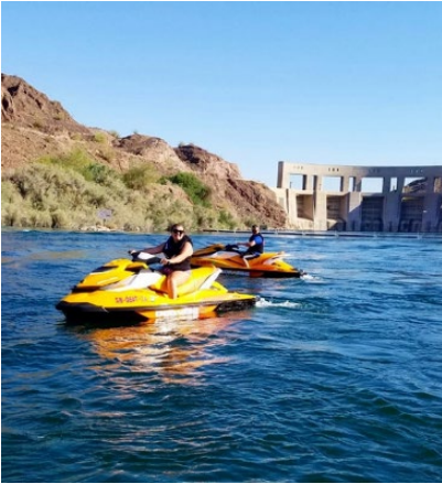
Parker Watercraft Rentals

Family-owned watercraft rentals in Parker announces Spring Break hours and rates Parker Watercraft Rentals , the family-owned and operated personal watercraft company on the Parker Strip, announced their spring hours and rates. Pending water levels, patrons are invited to enjoy the Parker Strip with Parker Watercraft Rentals starting at just $250 per day, plus tax and gas. Full day rentals are available 8 a.m. - 6 p.m. and include life jackets, all safety equipment, anchor, and dock line.