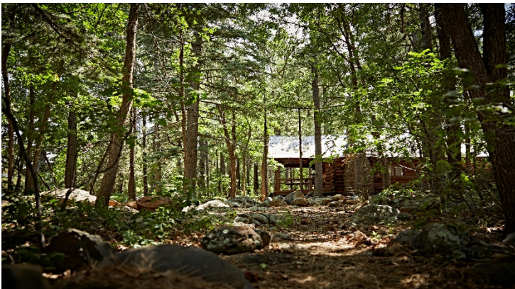
Two-bedroom cabin, Mormon Lake Lodge

PR Contact: Erika Pope Phone: (702) 249-2977 Email: erika@thevoxagency.com