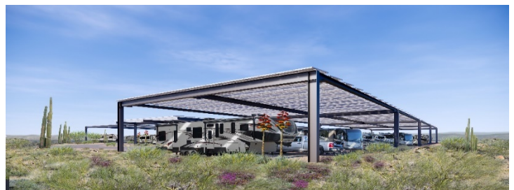
Covered RV Camp Sites, Verde Ranch RV Resort