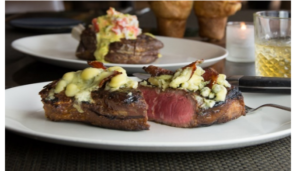
Lincoln, JW Marriott Camelback Resort & Spa