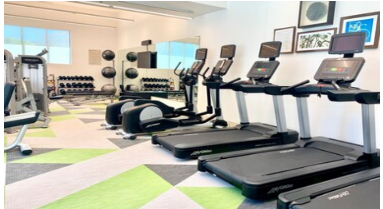
Fitness Center, Element Hotel