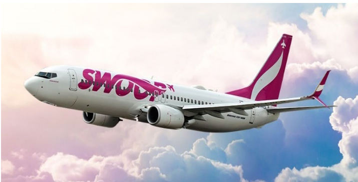
Boeing 737-800, Swoop Airline

Swoop , Canada's low cost airline and subsidiary of WestJet Airlines , now offers flights between Phoenix-Mesa Gateway Airport and Winnipeg's James Richardson International Airport . The new, non-stop route operates twice weekly on Thursday and Sunday through April 23, 2020. The flight will operate on a Boeing 737-800 aircraft, offering 189 passengers with in-seat power and Wi-Fi connectivity.