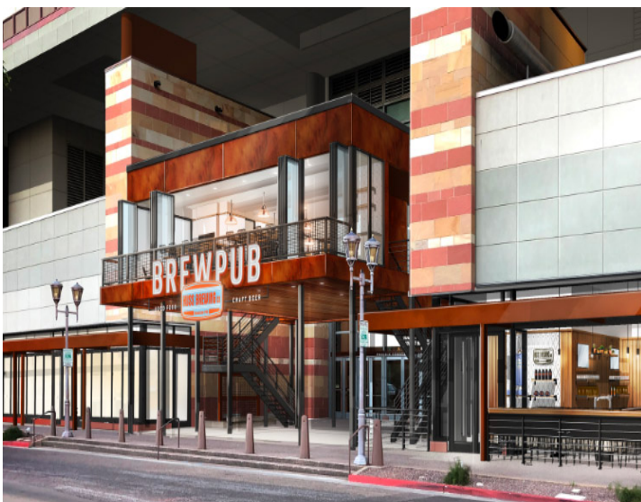
Exterior, Huss Brewing Co.