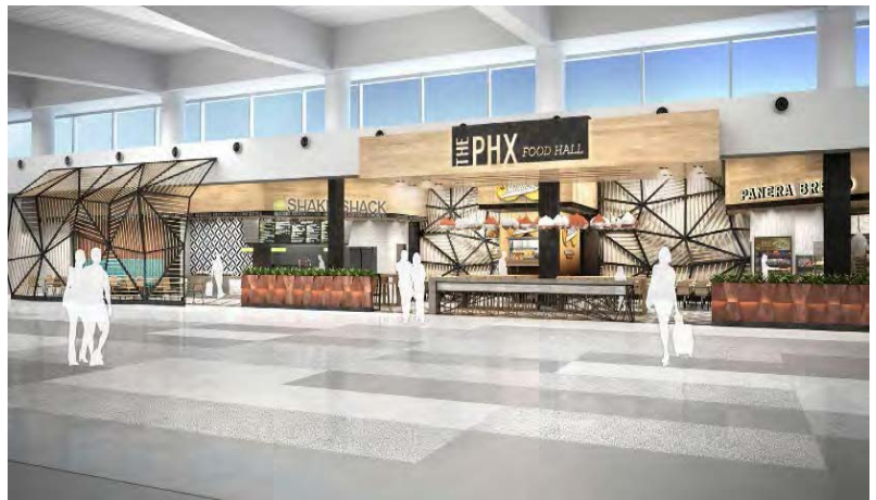
North concourse food court, Phoenix Sky Harbor International Airport