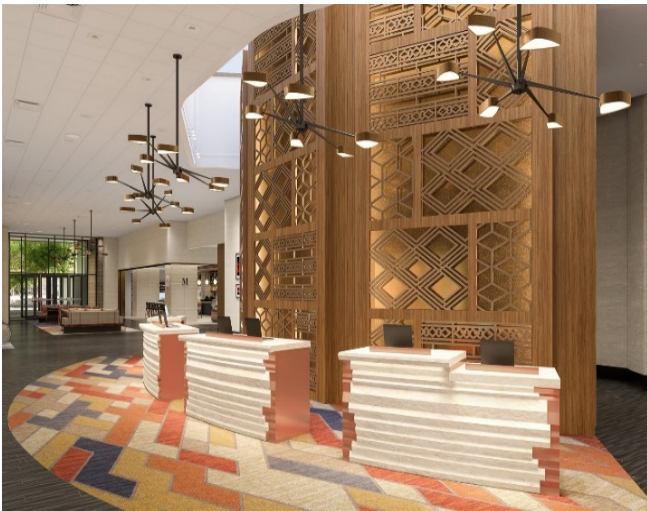
Lobby, Hyatt Regency Phoenix