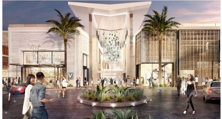
Scottsdale Fashion Square Luxury Wing Entrance, Macerich