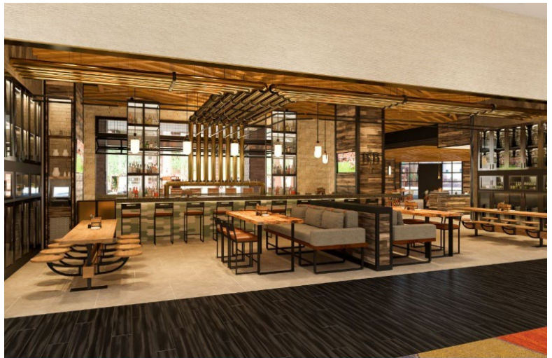
Barrel & Bushel, Hyatt Regency Phoenix