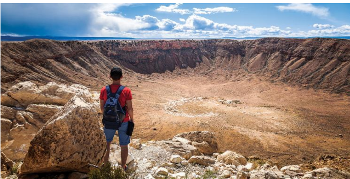
Meteor Crater, Discover Flagstaff

Conde Nast listed Meteor Crater , between Flagstaff and Winslow, as one of the must see Seven Wonders of the World