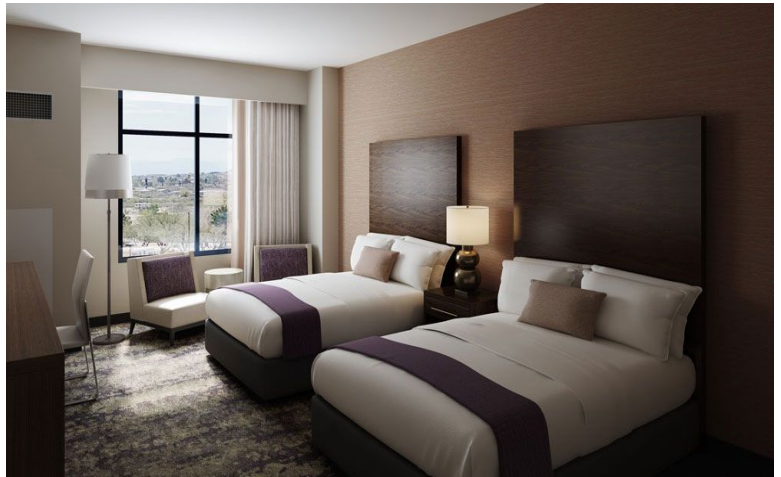
Double queen bed guestroom, Estrella

Estrella , located on 2.2 acres adjacent to Casino Del Sol in Tucson, is now open. The new 151-room hotel connects to Casino Del Sol by a covered walkway, allowing easy access to both properties. Estrella offers a variety of guestrooms and suites that include Serta Presidential mattresses with Egyptian cotton triple sheeting, 49" HDTVs, iHome digital alarm clocks, K-Cup coffee makers, refrigerators, complimentary Wi-Fi and more. The hotel has two meeting rooms that can hold between 25-50 people. Onsite amenities include a 24-hour fitness center and an 89-square-foot video arcade. The outdoor pool features a 100 ft. water slide and poolside bar. The addition of Estrella is the final phase of Casino Del Sol's hospitality project.