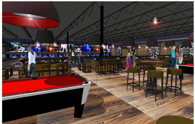
Bowling lanes and billiard tables, Mavrix