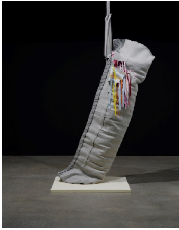
Jiimaan, Heard Museum