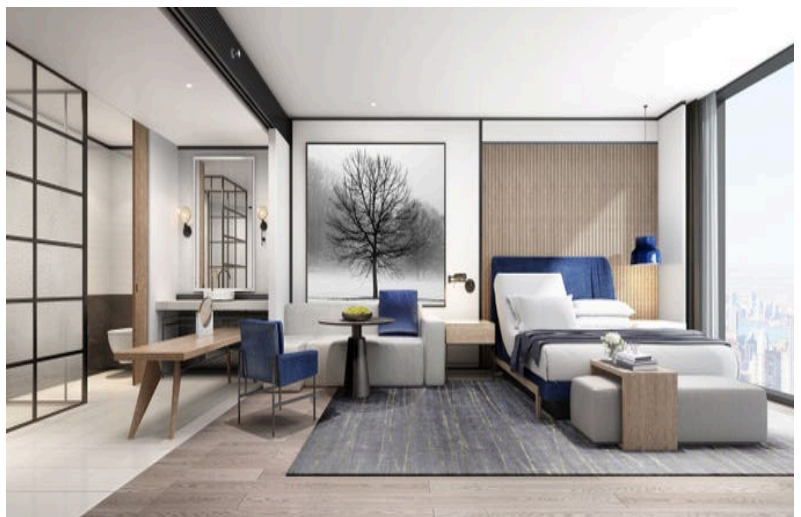
King suite, Sheraton Phoenix Downtown