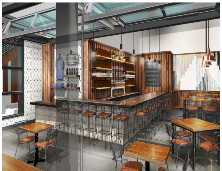
Bar, Huss Brewing Co.