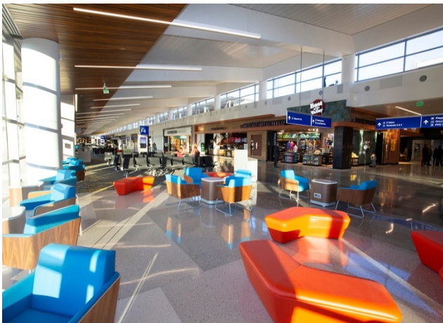
North concourse, Phoenix Sky Harbor International Airport

Contact: Sky Harbor Media Inquiries Phone: (602) 273-3300 Email: skyharborPIO@phoenix.gov