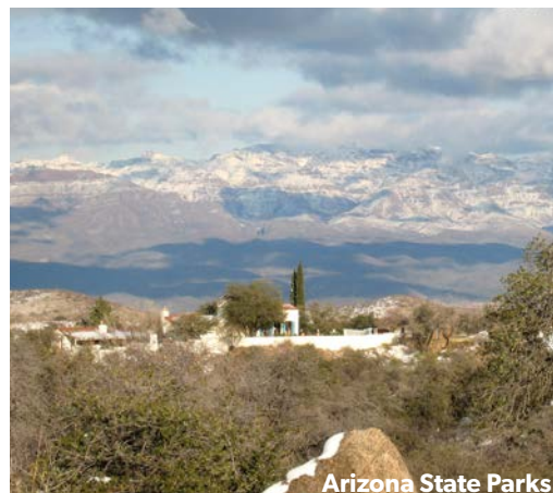
Arizona State Parks