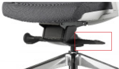
tilt control 3 position locking mechanism