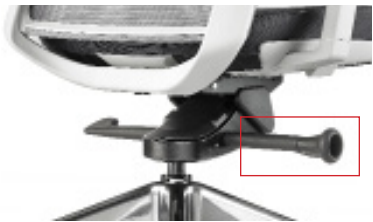
tension adjuster (controls resistance to body weight)