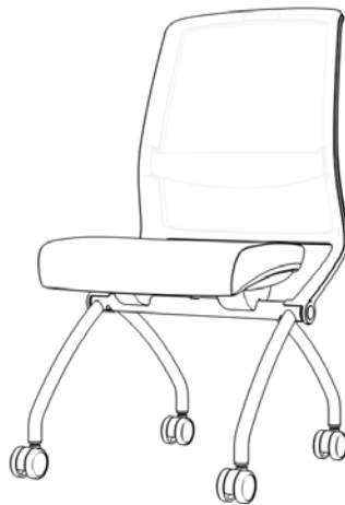
Mesh Back Armless